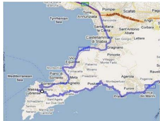
Figure 1. Areas under study.

The case study company examined in this paper will be referred to as "Company A" (for the sake of confidentiality) and provides ordinary and express shipping services in Mariglianella, by managing transport and delivery of products of various sizes in the Neapolitan territory (Southern Italy). This company is taken as a case study for investigating the CVRPTW for a CEP, with the aim to minimize the total time of goods delivery to the established customers, at the same time meeting the constraints of the fixed TWs. The company serves 29 main customers in the areas of Sorrento, Gragnano, Agerola, Pompei and Castellammare di Stabia (Figure 1).