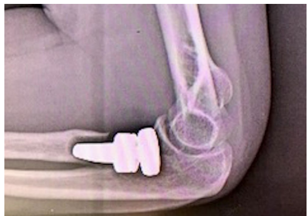
Fig. 2 A case of aseptic loosening of the uncemented implant two months after surgery