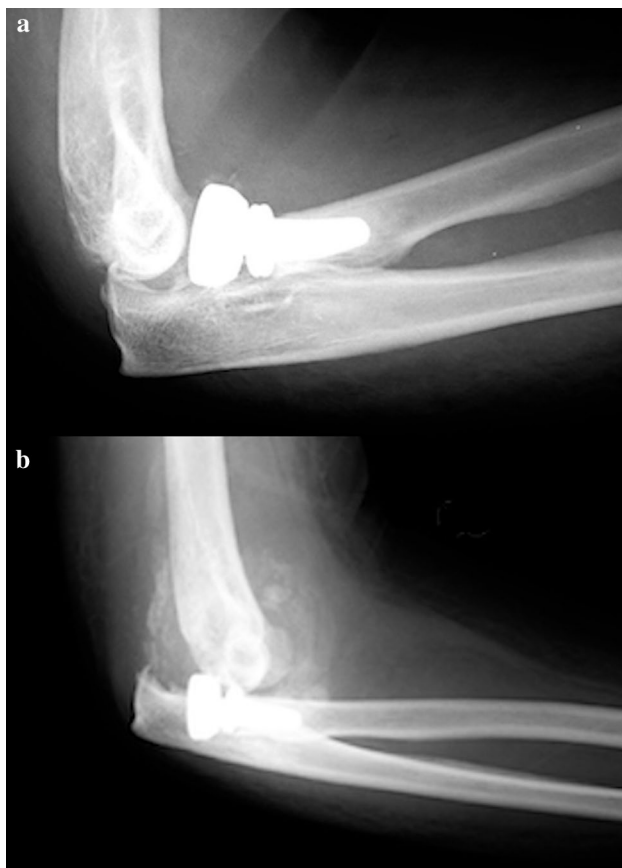
Fig. 1 a A 71-year-old female patient treated with an uncemented prosthesis due to a terrible triad injury. b Dislocation of the prosthesis at 1 month with the need of dynamic hinged external fixation and removal of the implant. Presence of heterotopic ossification grade IV

revision with further suture anchors for both medial and lateral symptomatic instability. The overall implant removal rate was 17.6% (3/17) with no case of replacement of the implant or disassembling. At last follow-up, heterotopic ossifications were observed in 10 out of 17 patients (59%), classified as Ilahi–Gabel grade I in 2 cases, grade II in 4 and grade IV in 4. Radiological finding of osteolysis, visible as radiolucencies around the stem, was detected in 9 out of 14 cases (64%) excluding cases with the early removal of the prosthesis; according to Morrey, osteolysis was classified as type 0 in 5 patients, type I in 2, type II in 2, type III in 1 and type IV in 4. The temporal evolution of osteolysis between the postoperative follow-up, and the last follow-up is shown in Table 2; both patients with early aseptic loosening of the stem were classified as Morrey type IV at early postoperative follow-up. Statistical analysis with Pearson R test did not prove any strong positive or negative linear dependence between variables, finding no predictive factors of worse MEPS, pain or instability. Moreover, the amount of osteolysis showed just a weak negative linear correlation with MEPS ( R = -0.232 ) and a weak positive linear correlation with proximal forearm pain ( R = 0.252 ) resulting in nonsignificant p value for confidence interval of 95%.