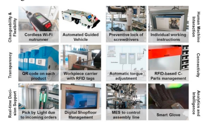
Fig. 2. Application of Industry 4.0 enabling technologies for case study.

In this article, the case study is designed based on the Industry 4.0 Innovation Center, which is an assembly line with four stations. It could provide the real production case through the assembly of the valve slides. Some application of Industry 4.0 enabling technologies (see Figure 2) are available such as Cordless Wi-Fi nutrunner, Digital shop floor management or Pick by light technology. It provides the further insight of production management for the trainees. The output of this phase is to connect the theoretical knowledge into the practice, meanwhile realize the self-reflection and peer discussion. The trainees are able to understand the knowledge deeply and are motivated to transfer the knowledge into their own working environment.