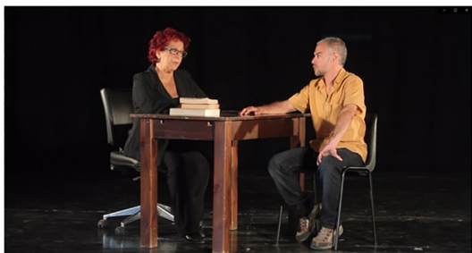
FIGURE 2 | Frames of social interaction's videos.

The number of therapy hours will be recorded and will represent a covariate in group comparisons.