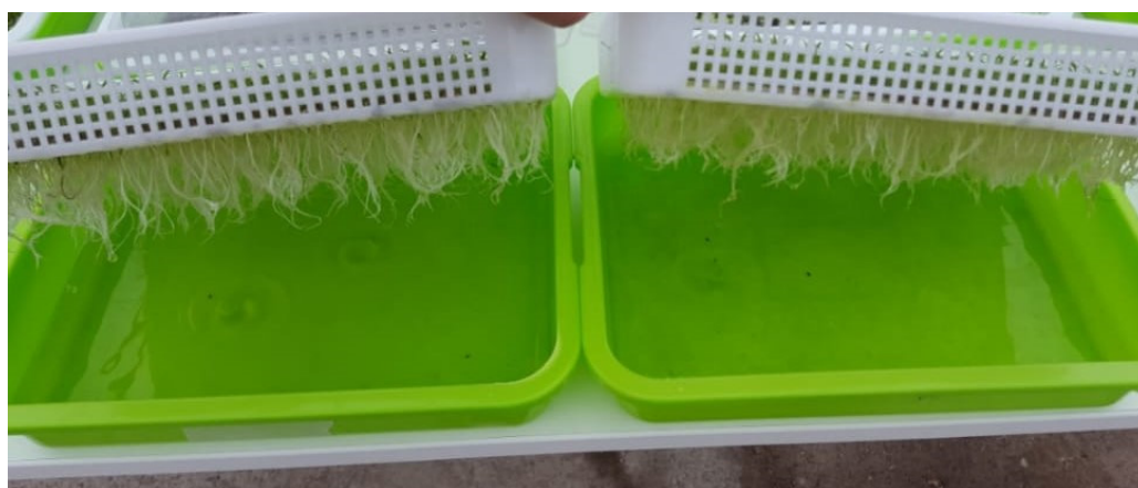
Figure 1. Hydroponic system (floating raft system) implemented in this study, showing the perforated plastic trays and the plastic tanks, and the growth of the roots directly in the nutrient solutions (not to scale).

NS was prepared with osmotic water (electrical conductivity (EC) of 0.03 \text{ dS m}^{-1} and pH of 6.2) as follows: 2.0 \text{ mM NO}_3^- , 0.25 \text{ mM S} , 0.20 \text{ mM P} , 0.62 \text{ mM K} , 0.75 \text{ mM Ca} , 0.17 \text{ mM Mg} , 0.25 \text{ mM NH}_4^+ , 20 \text{ }\mu\text{M Fe} , 9 \text{ }\mu\text{M Mn} , 0.3 \text{ }\mu\text{M Cu} , 1.6 \text{ }\mu\text{M Zn} , 20 \text{ }\mu\text{M B} , and 0.3 \text{ }\mu\text{M Mo} , with an EC of 0.4 \pm 0.05 \text{ dS m}^{-1} and pH of 5.8 \pm 0.2 . During the growth of microgreens, fresh NS was added every other day to the tanks in order to maintain the original volume of 1.1 L. The tanks were arranged in a randomized factorial scheme ( 2 \times 2 ), which involved a biostimulant application, an untreated control, and two species of microgreens (dill and carrot). Each treatment was replicated three times, with each tray consisting of a single replicate (experimental unit). Dill and carrot microgreens were harvested 22 and 25 days after sowing (DAS), respectively, when the first true leaf appeared.