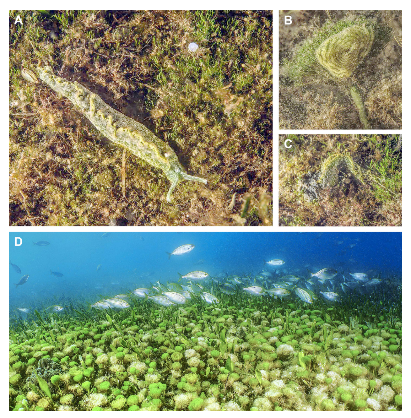
Figure 3. Elysia nealae in the changing seascapes in Lu Carragioni, Olbia, Sardinia (Tyrrhenian Sea) A. Living specimen (voucher specimen RM3_1825) photographed in situ . B. Coiled egg mass on the erect form of Penicillus capitatus . C. Animals burrowing in the sediment in response to light (voucher specimens RM3_1825 and RM3_1827). D. Wide view of one of the patches of Penicillus capitatus where E. nealae was found.

directed folds meeting dorsally. Rhinophores slender, straight, tapering toward extremities and directed anterolateral. Eyes prominent, placed at posterolateral bases of rhinophores, each surrounded by a small white area. Foot slightly bilobed with a shallow median notch anteriorly and tapered to an obtuse point posteriorly. Mouth located at median margin of head shield. Pale green throughout with small white specks and fine concentrated masses of green algae, particularly conspicuous on parapodial lobes. Margin of parapodial lobes and posterior tip of body greenish yellow.". The original description does not provide information on internal organs, and genetic data are not available in public databases. Our review of the external morphology of 107 existing species revealed