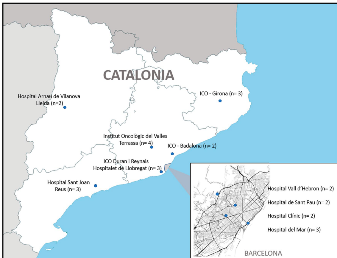
Fig. 1 Participating centres and number of surveyed experts

In May 2018, the first in-person meeting of the consensus-building process took place. Fourteen questions were selected to answer the main controversial issues. The 14 survey questions were approved, and the most current literature was reviewed. The questions were then subjected to an independent vote among all experts of the working group. The vote was conducted online to avoid any influence from