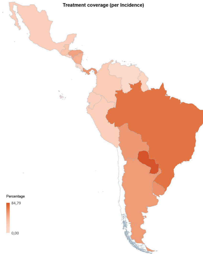
Fig. 2: treatment coverage per incidence. Colors represent the ratio between the average of treatments prescribed (benznidazole plus nifurtimox) between 2017 and 2019 and the estimated new cases per year per country (estimated annual number of new cases due to vectorial transmission plus estimated cases due to congenital transmission). Numbers are expressed by percentages. Data related to treatment have been obtained from PAHO and Laboratorio Elea (Benznidazole manufacturer). Chile has been not included in the figure because the proportion of treatments compared to the annual incidences yields a percentage of 466%. Data related to patients have been extracted from Chagas disease in Latin America: an epidemiological update based on 2010 estimates. (63)