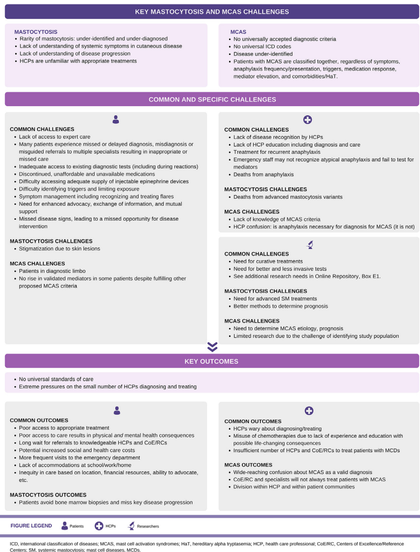
FIGURE 2. Key mastocytosis and mast cell activation syndromes (MCAS) challenges and resulting outcomes.