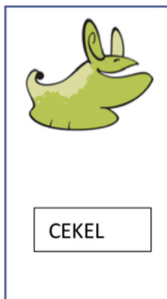
Fig. 1. Example of an item in the vocabulary learning test.

Vocabulary learning. This test was based on the vocabulary learning subtest of the Language Learning Aptitude for MA students (LLAMA; Rogers et al., 2017). Participants learned the names of a series of creatures and were told that they would be tested on them later. They were instructed not to take any notes during the test. Participants were presented with 20 pictures of novel creatures (selected from Romanova, 2015) paired with 20 novel words (e.g., CEKEL, as shown in Fig. 1) simultaneously on the screen and were given 2.5 min to memorize them. They then underwent two testing sessions – the first immediately after the learning phase. In the testing phase, all the creatures and names were displayed on the screen and participants were asked to drag and drop the names under the correct pictures within 3.5 min. Approximately 30 min later, at the end of the experimental session, they were tested again to assess delayed recall. We devised two parallel versions of the test using different creatures and novel words in each. Participants were randomly