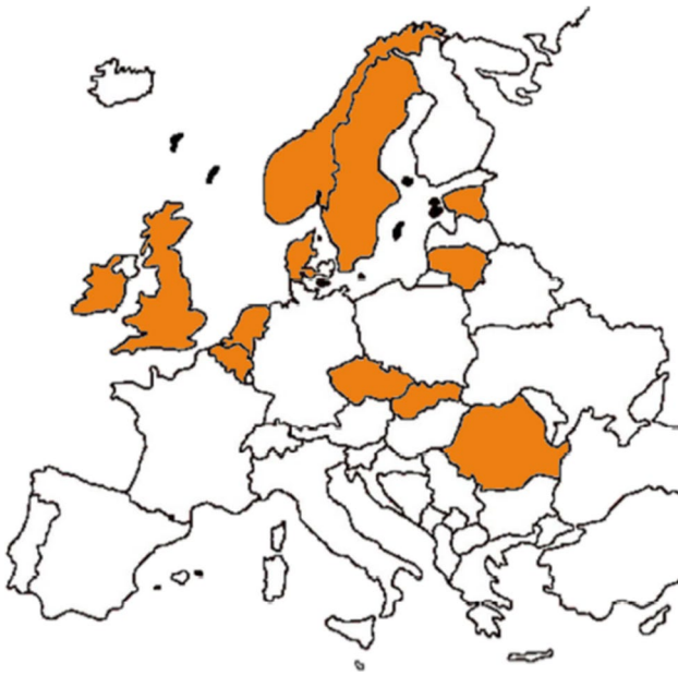
Fig. 1 Representation of countries that declared clinical and/or pre-clinical research was somewhat put on hold due and during the Covid-19 period 09/2020-09/2021. Most but not all countries gave an input.

year, only 2/32 countries (6%) saw PET-CT increase at all and this was by less than 25% [1]. In both two countries (Estonia and UK), further increase in PET/CT was observed in 2021 while conventional nuclear medicine slightly decreased.