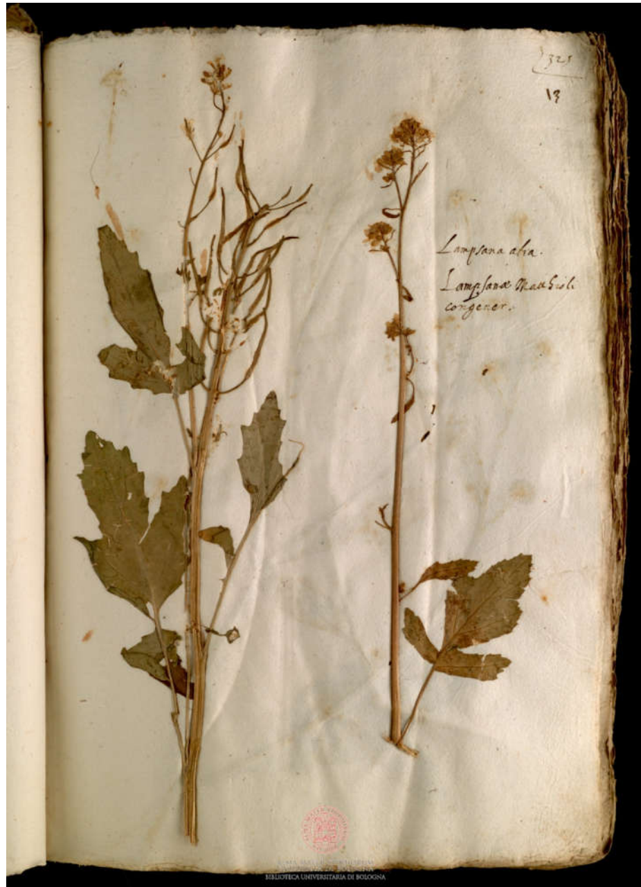
Figure 4. Specimen of Sinapis alba L. preserved in Erbario Aldrovandi, vol. IV, c. 13r.; on the sheet, “Lampsana alia, Lampsanæ Matthioli congener” is written.