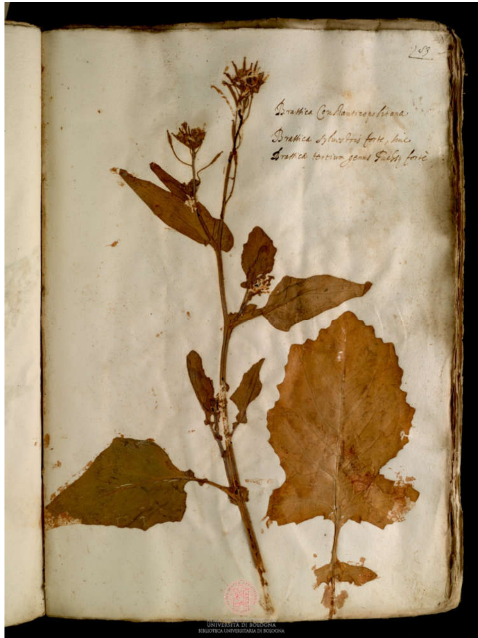
Figure 3. Specimen of Brassica rapa L. preserved in Erbario Aldrovandi, vol. V, c. 83r.; on the sheet, “ Brassica Constantinopolitana , Brassica sylvestris forte , siue Brassica tertium genus Fuchsij forte ” is written.