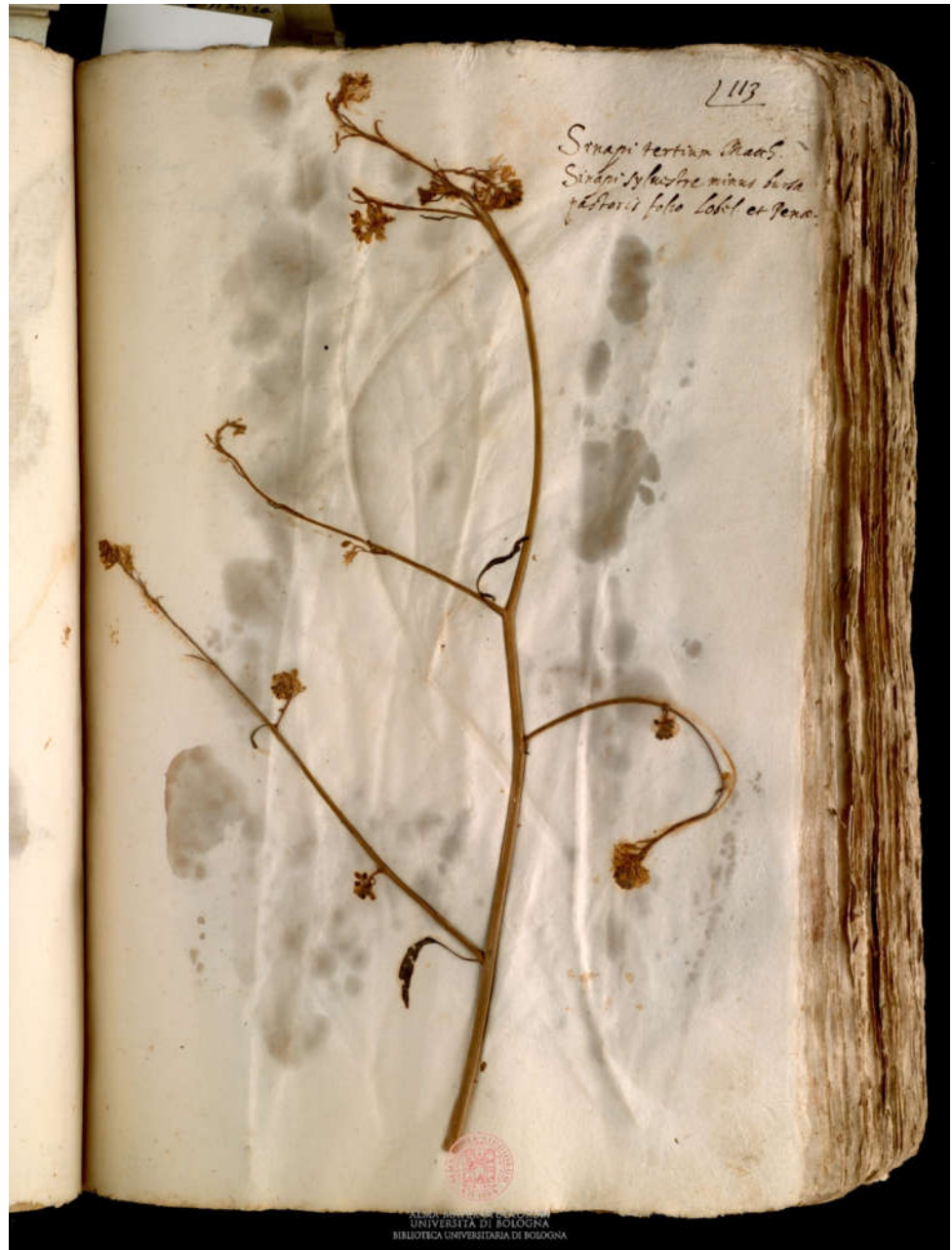
Figure 2. Specimen of Brassica nigra W.D.J. Koch preserved in Erbario Aldrovandi, vol. II, c. 113r.; on the sheet, “Sinapi tertium Matth., Sinapi sylvestre minus bursa pastoris folio Lobel. et Penæ” is written.