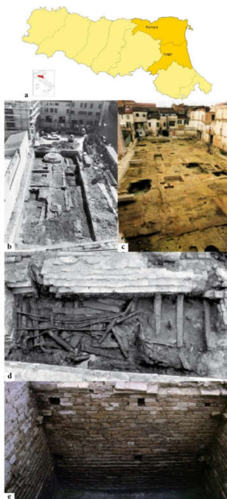
Figure 1. The two archaeological sites examined: Ferrara (context I—no. 16c) and Lugo (context II—no. 15); geographic location (a), overview of archaeological excavation (b,c) and pits (d,e).

In this study, the seeds were investigated by morphometric and genetic analyses. Furthermore, a historical and ethnobotanical interpretation of the taxa was performed using written sources and the exsiccata present in the oldest Italian herbaria.