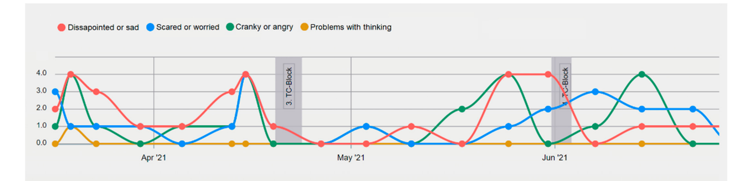
Figure 2. MyPal Symptom Trajectory. Example of symptoms reported by a patient undergoing chemotherapy treatment with topotecan/cyclophosphamide (TC-Block). This patient tended to show increased emotional distress symptoms prior to an upcoming chemotherapy block. Symptoms are graded according to their severity (not present to extremely strong).