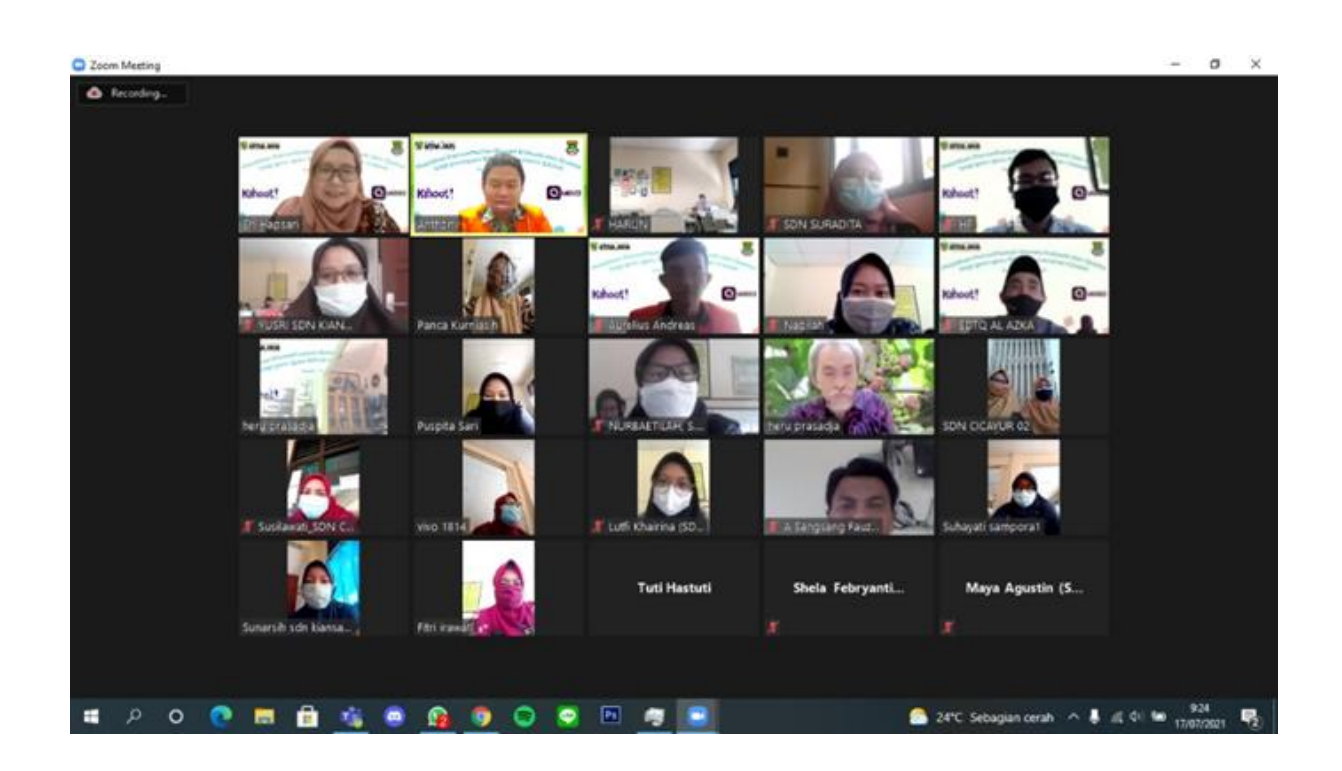
Figure 2. Discussion and sharing experiences

Material exposure sessions are delivered through Quizizz demonstrations. Demonstrations of Quizizz aroused the teacher's curiosity. Teachers take the stages of making quizzes at Quizizz. After the demonstration, the discussion session also invited a deeper sense of curiosity. In discussions, some teachers share their experiences in using Quizizz or another games applications such as Kahoot (Figure 2).