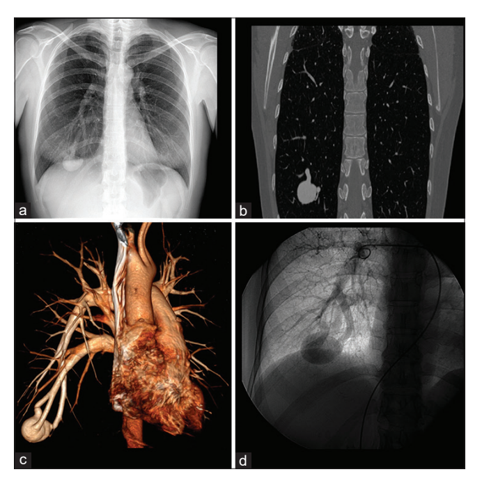
Figure 1: Right lower lobe pulmonary arteriovenous malformations as depicted at (a) chest X-rays; (b) chest angio-computerized tomography on coronal slices and (c) three-dimensional reconstruction; (d) pulmonary angiography

Reevaluation of c-TCCD at our institution showed an RLS incrementing while the patient assumed the erect posture and not modified while a Valsalva maneuver was performed. The patient also reported a history of recurrent epistaxis. Thoracic angio-CT showed at least two PAVMs at the right inferior and left inferior pulmonary lobes with multiple afferents at pulmonary angiography [Figure 2]. Genetic analysis showed the presence of a novel heterozygous ENG mutation (c. 1214_1219del; p. Leu405_Ser407delinsCys) also detected in an affected first-degree relative with HHT and a single asymptomatic PAVM. A diagnosis of definite HHT according to "Curaçao criteria" was achieved, and the patient successfully underwent occlusion of both