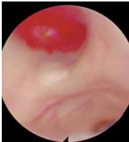
Fig. 2. Intraoperative endoscopic view of the vascular pituitary stalk hemangioblastomas