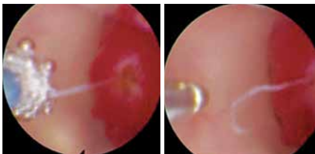
Fig. 4. Coagulation with monopolar (left) and detachment with forceps (right) of the adhesion