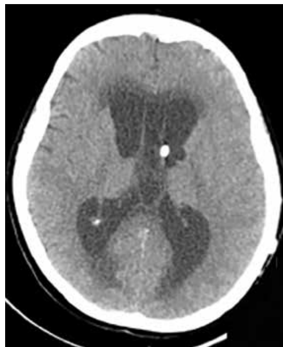
Fig. 1. Preoperative CT scan showing hydrocephalus with transependymal edema in a malfunctioning left ventriculoperitoneal shunt

A 44-year-old woman affected by VHL disease was admitted to our hospital because of headache, worsening of tetraparesis and drowsiness. Her medical history was significant for several operations to resect three cerebellar and one bulbar HBs, and for a left frontal VP-shunt placement. The patient harbored new HBs at the pituitary stalk, obex and cervico-medullary junction that were managed conservatively. The HB of the obex consisted of a little mural nodule and a large associated cyst. Emergency head CT scan showed hydrocephalus (Fig. 1) and trapped fourth ventricle. A neuroendoscopic exploration was performed with a flexible scope (Karl Storz, Tuttlingen, Germany) through an already existing right precoronal burr hole, in order to explore the ventricular