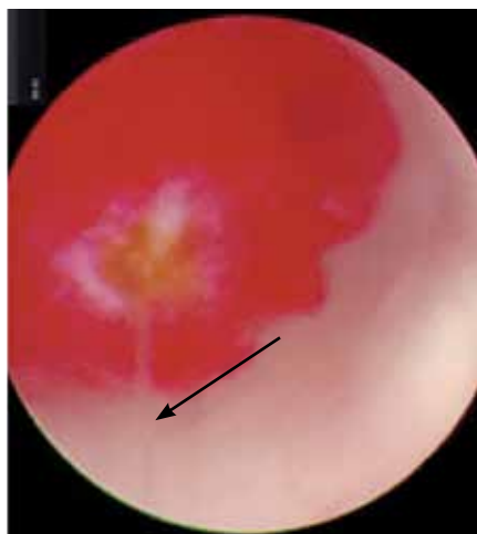
Fig. 3. Intraoperative image showing the fibrous band (arrow) attached to the hemangioblastomas with an inflammatory reaction on its surface