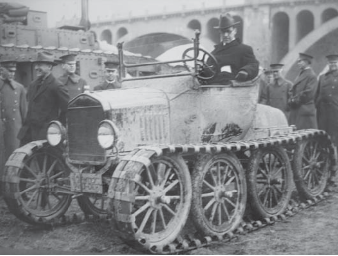
Newton D. Baker, secretary of war.

Undated and uncaptioned photograph, LC USZ62-26506, Library of Congress Prints and Photographs Division, Biographical File: "Baker, Newton Diehl."