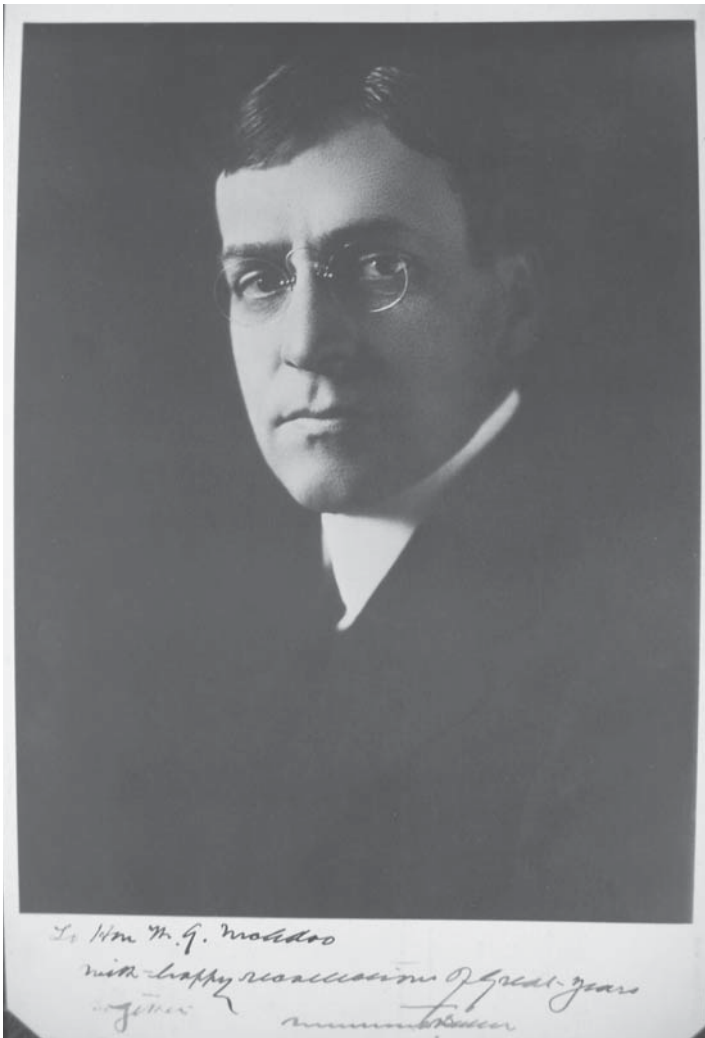
Inscribed photograph: "To Hon. W.G. McAdoo, "With Happy Recollections of Great Years Together, Newton D. Baker, February 3, 1921."