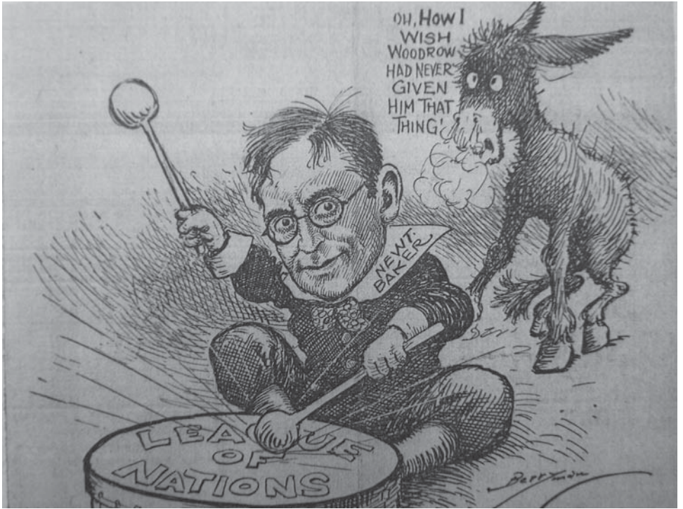
Clifford Berryman cartoon, "Oh, How I wish Woodrow had never given him that thing!" Washington Star , January 19, 1932. Baker MSS, Hayes-Baker Correspondence, Container 264, File: "Jan-Feb, 1932."