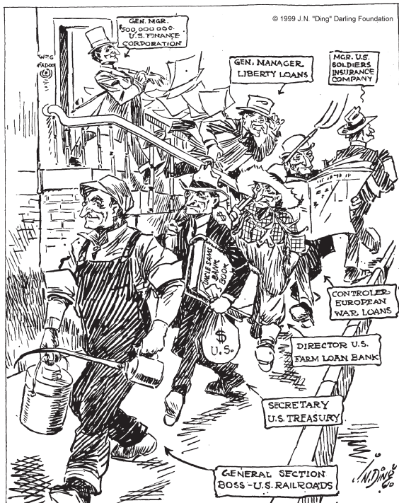
Jay N. "Ding" Darling Cartoon, "Picture of William G. McAdoo Going to Work in the Morning," March 13, 1918

Undated and uncaptioned photograph, LC USZ62-26506, Library of Congress Prints and Photographs Division, Biographical File: "Baker, Newton Diehl."