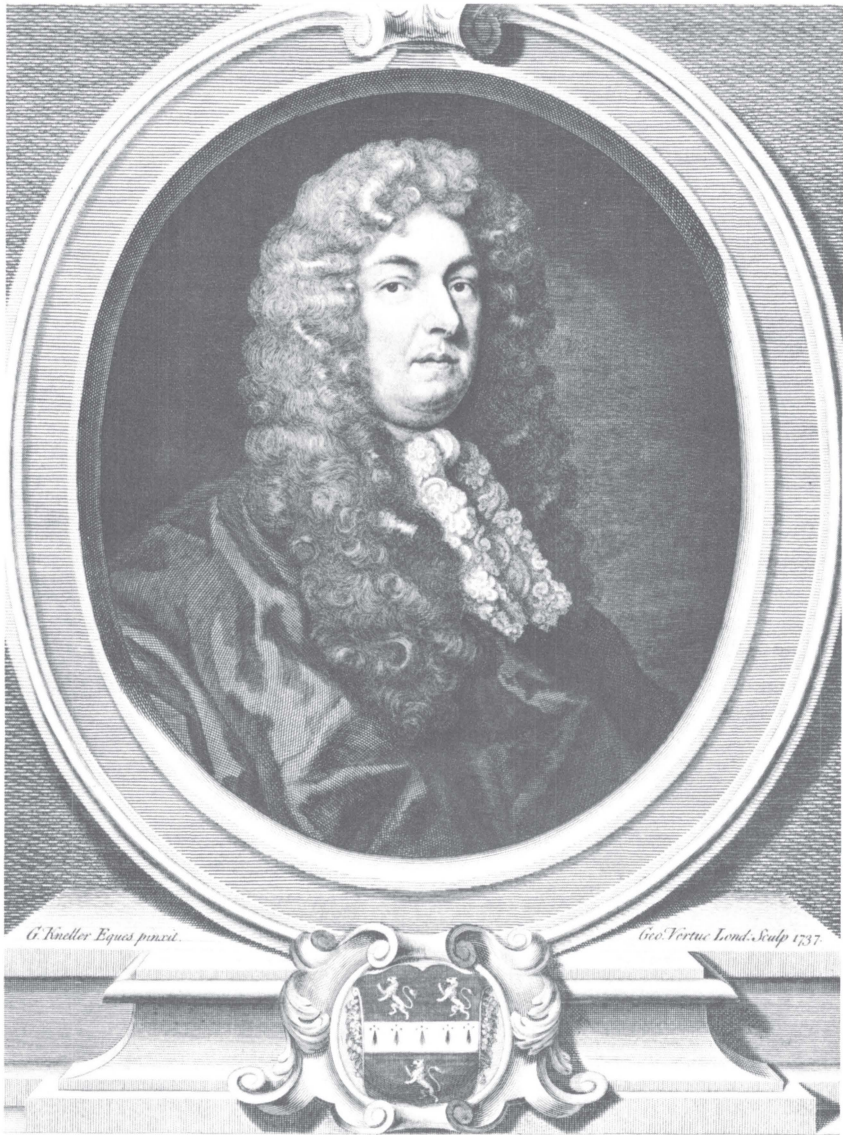
HENRY POWLE Esq. Speaker of the HOUSE of COMMONS & MASTER of the ROLLS

Henry Powle (1630–1692) (left) and Sir Thomas Lee (1635–1691) (right) were prominent leaders against the standing army in the House of Commons in the 1670s and in the Convention Parliament of 1689.