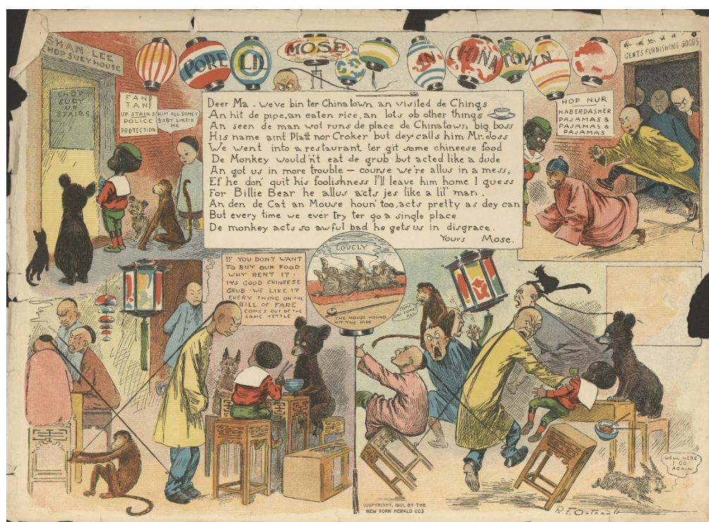
Figure 2. Image of page 38 of Pore lil Mose . Available through Michigan State University Digital Collections: https://d.lib.msu.edu/gnn/1483 (accessed on 4 May 2022).

Subject headings also cannot give the full picture of racial representation in each comic. Later on in Pore lil Mose , we are presented with a letter about his visit to Chinatown, and the representation is no more respectful than that of Mose himself (Figure 2).