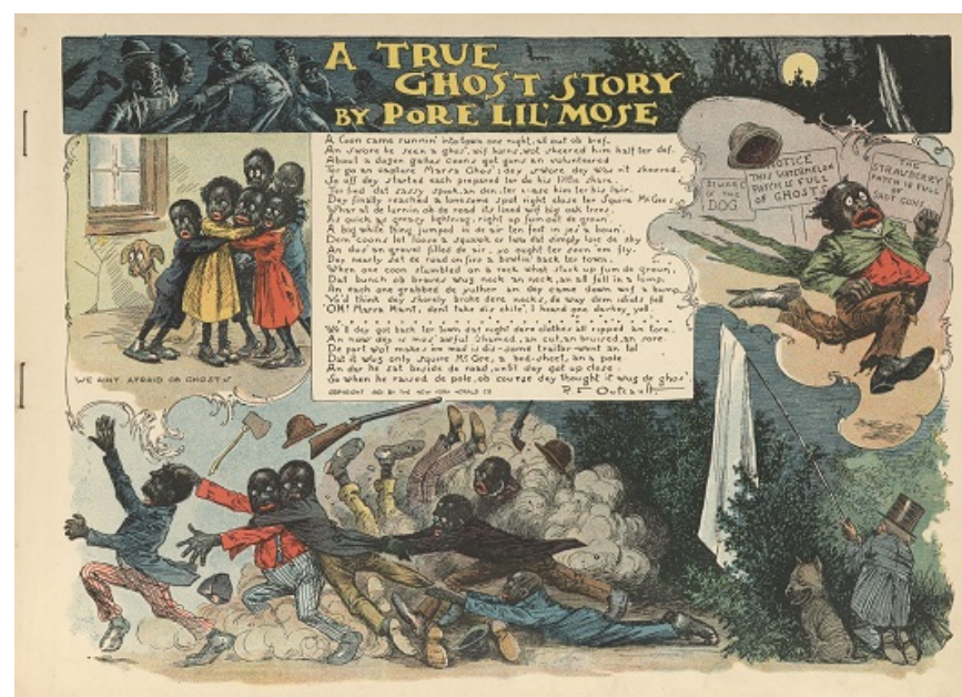
Figure 1. Image of page 4 of Pore lil Mose . Available through Michigan State University Digital Collections: https://d.lib.msu.edu/gnn/1449 (accessed on 4 May 2022).

However, these terms do not always indicate respectful representation of the group in question. Many early comics labeled with these subject terms are pure racial caricature. Take, for example, “Pore lil Mose: his letters to his mammy” from 1902, written by Buster-Brown creator Richard Felton Outcault (1902). It depicts a young Black boy, among other Black characters, in a style akin to that used in minstrel shows. Pore lil Mose writes poems framed as letters to his “mammy,” a racist stereotype of Black women domestic workers, in a “Negro” dialect rife with slurs such as “coon” and “darker.” (Figure 1).