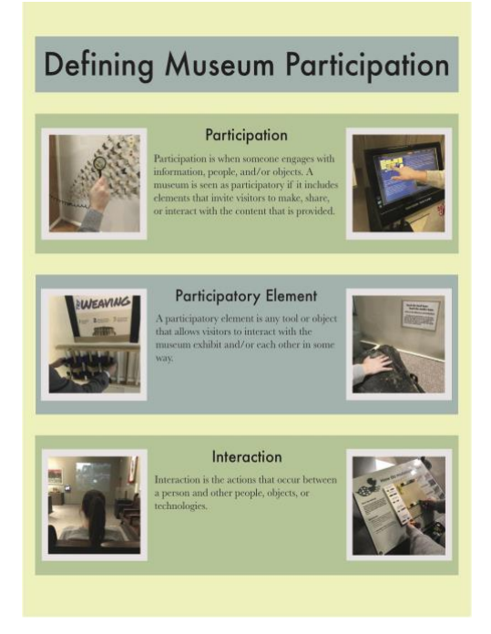
Figure 2: Definition Guide

The definition guide [Figure 2] was created to simplify UX terminology related to participation and present it in a visually appealing and informative format. The definitions on our guide are synthesized from the research of Simon and Shirky. We used images from the MSU Museum in order to illustrate a few of the ways visitors can participate within a museum space. These examples cannot account for all of the participatory features that are present in museums or all of the ways visitors participate while at a museum. However, they do demonstrate some of the modes of participation at play in a museum environment so that other museums might consider what participation looks like at their own institution.