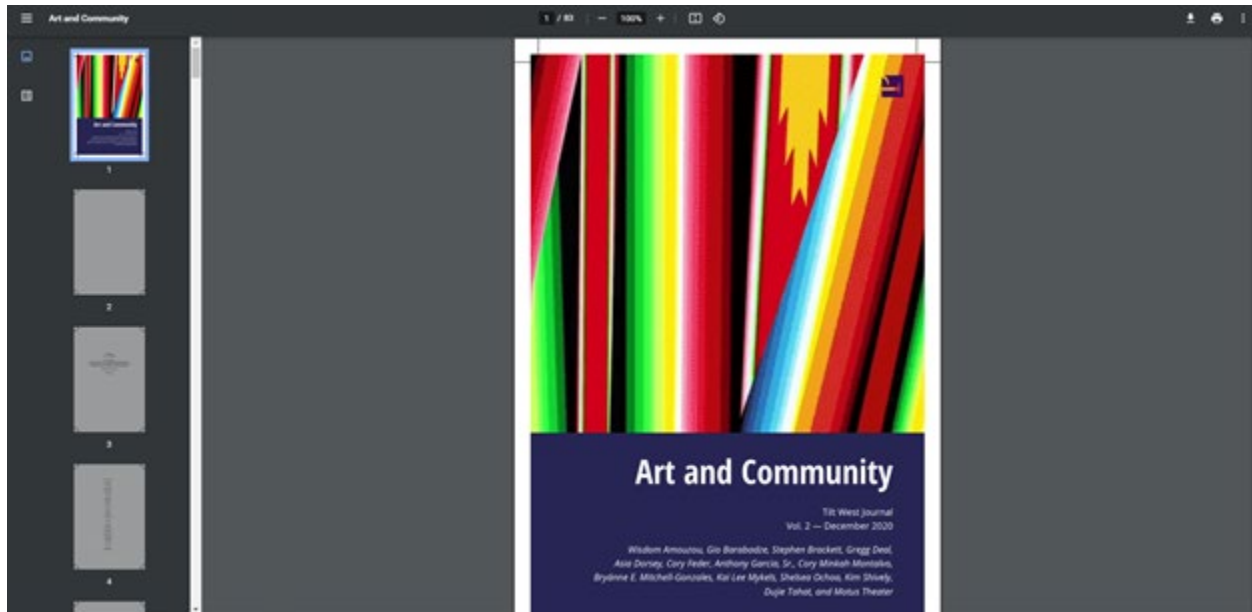
PDF view of Art and Community issue.

for $30. Tilt West usefully provides citations in both Chicago and MLA formats and carry a Creative Commons Attribution-NonCommercial-NoDerivatives 4.0 International (CC BY-NC-ND 4.0) license. This review will primarily discuss the browser-based experience of Tilt West Journal .