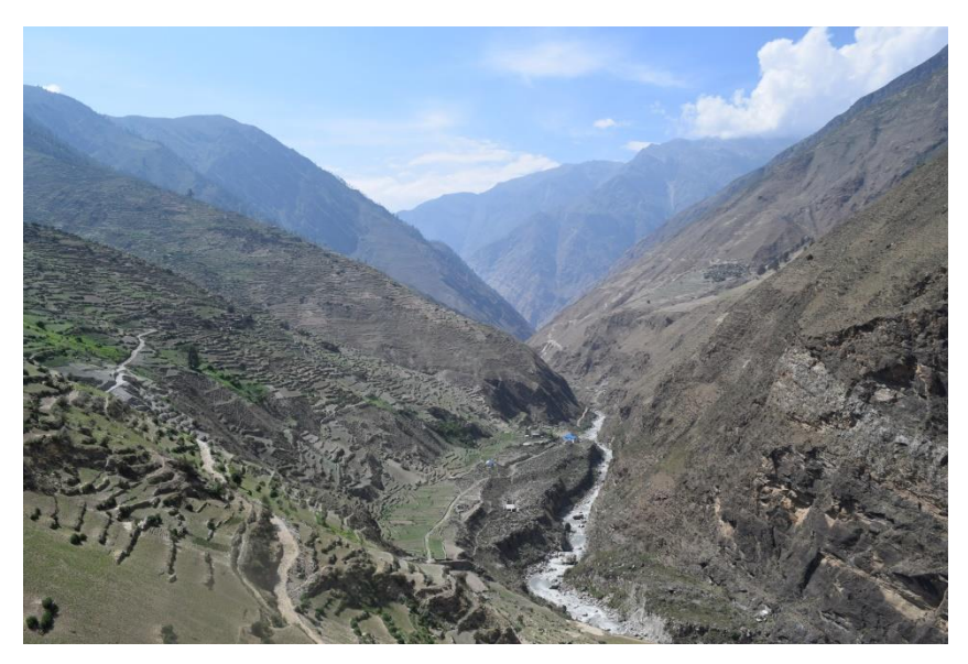
Figure 3: The Tichurong speaking village of Lawan appears on the right side of the Thuli Bheri river.

likely to use Tichurong in all domains, men tend to use Nepali for counting, humour, and in primarily male spaces such as community meetings and political discussions. Lower levels of literacy in Nepali are associated with greater use of Tichurong in all areas, and literate residents of the valley use Nepali for writing letters and recording meeting minutes.