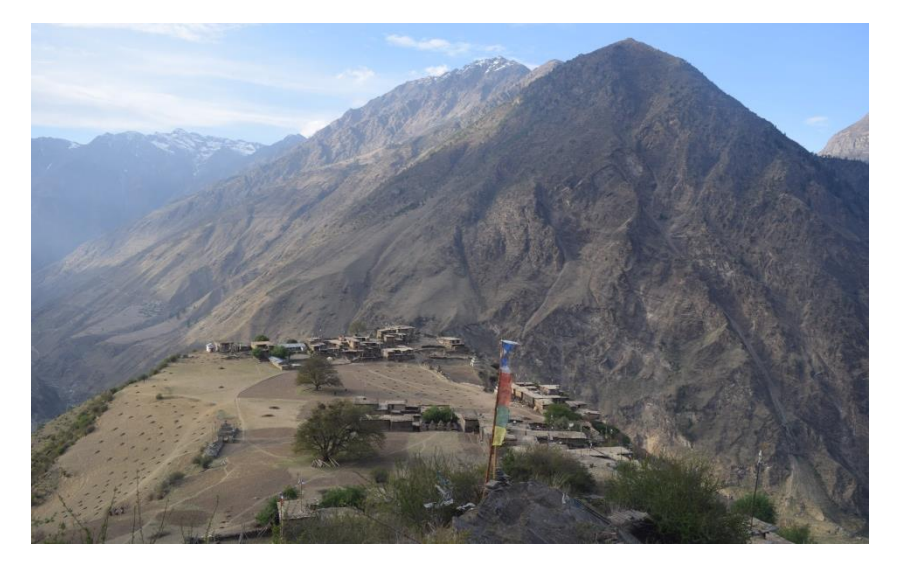
Figure 2: The largest Tichurong-speaking village of Gumbatara.

The Tichurong language is spoken in 18 out of 24 villages in the Tichurong valley, depicted in Figure 1. The smallest hamlets of just a few houses do not appear in the map. According to the decennial census of Nepal conducted in 2011, there were 780 households and 3,576 people in the Tichurong valley across Lawan and Sahartara Village Development Committees (VDCs) (Government of Nepal 2014a), which have since been combined to form the Kaike Rural Municipality, as a result of local elections in 2017. A new census is currently underway. Gumbatara is the largest Tichurong-speaking village, followed in decreasing order of size (both in terms of population and number of households) by Kola, Baijibara, Banthada, Khani, Chilpara, Lawan, Tachin, Rukha, Dharapani, Byasi, Khani Gumba, Sariba (Syala), Namdel, Gufa, Nakko, and Chhoredada. In the village of Byasigad, five out of 16 households speak Tichurong; the remainder speak Nepali. As a result of a 2019 field survey conducted by Jag Bahadur Budha, at the behest of the Kaike Rural Municipality, we understand the Tichurong language to be spoken by 2,700 individuals.