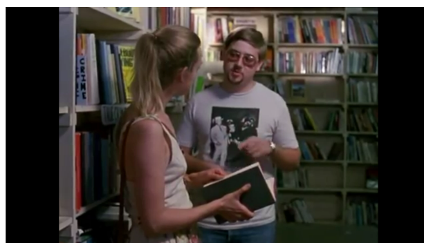
Illustration : 'real crimes' aficionado segment in Slacker (a.k.a. hey, remember, we had an anthropology class together...)

- But, then, of course, there's my real favorite one right here. Which you really should snap up