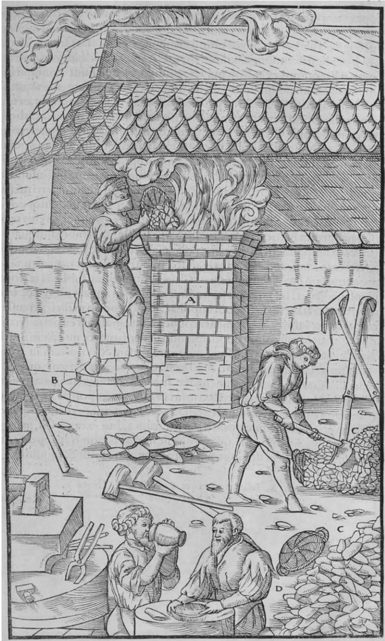
Figure 2. Artisans work in the background and rest in the foreground between rounds of smelting. Georgius Agricola, De re metallica , 12 vols. (Basel, 1556), 9:341.