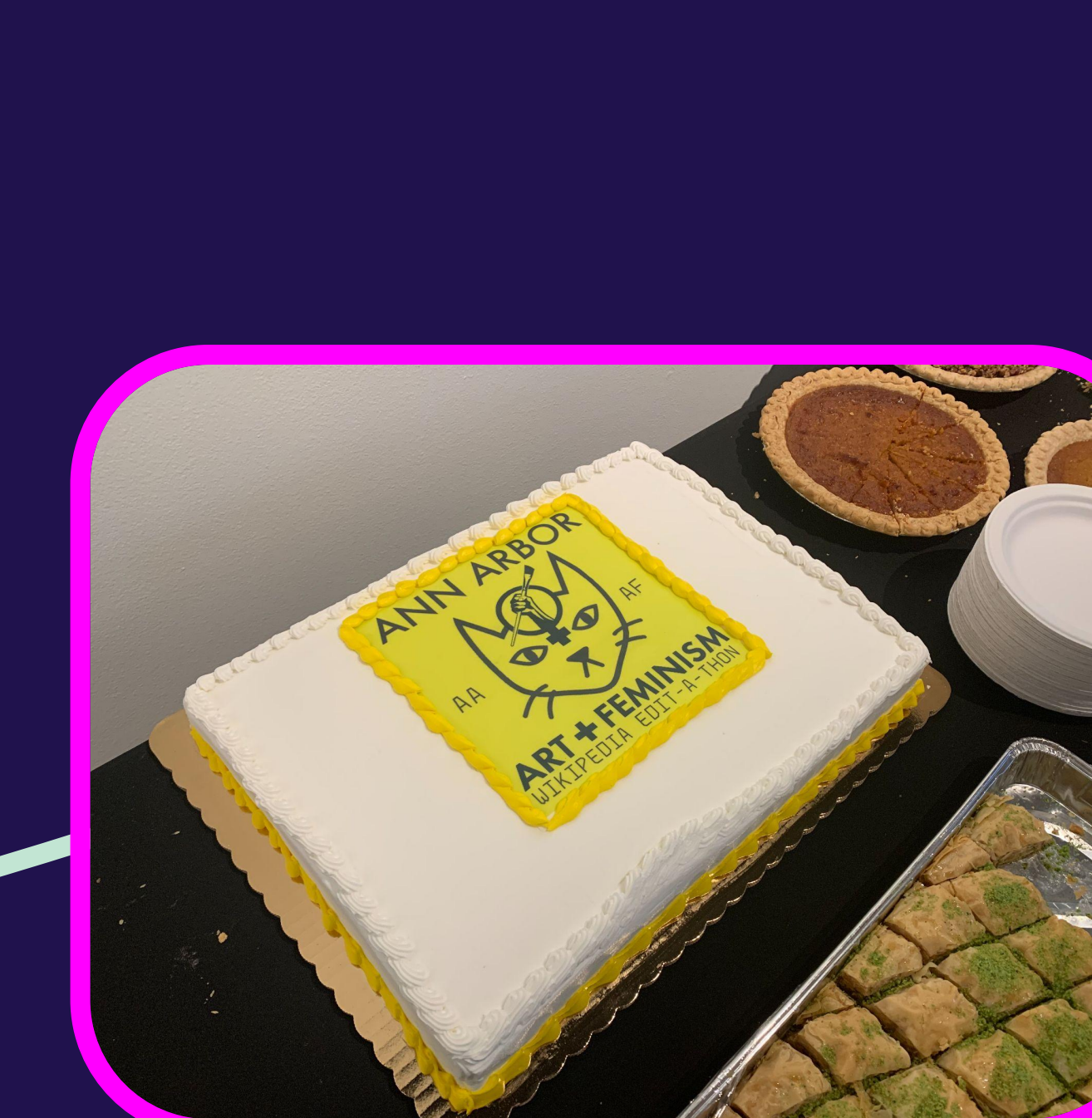
A celebration cake at the Art+Feminism Wikipedia Edit-a-thon, February 2020