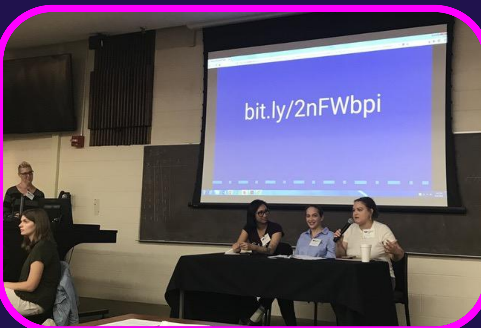
Presenting at Network Detroit, Fall 2019