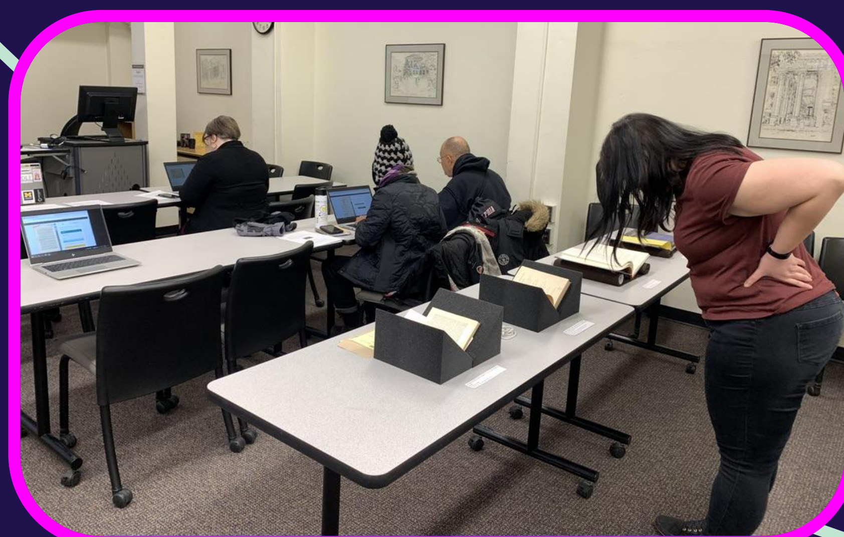
Transcribe-a-thon and viewing archival materials at Douglass Day, February 2020