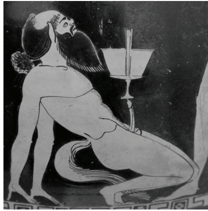
Figure 9. Satyr balances a drinking cup on his erect phallus

sexual arousal facilitated his association with fertility; consequently, his image frequented Roman gardens. Moreover, as the erect phallus of Priapus bore a similarity to the Greek herm, and indeed was often portrayed in herm-like fashion, with a head and torso emerging from a square pole, as depicted in a fresco in the House of the Surgeon in Pompeii. 30 Like the herm, Priapus serves a protective function; for example, in the Priapea , a collection of verses from the late first century or early second century CE, he is understood to protect from sexual violation women and children, both male and female, in the garden over which he presides, and to protect the garden and household against thieves. 31