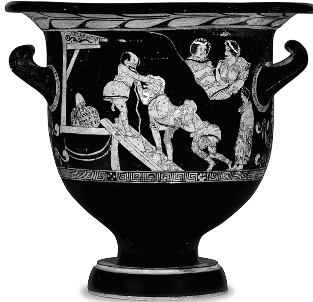
Figure 5. Scene from South Italian comedy; underhanging phallus props prominently on display

Chiron is depicted as a paunchy, elderly man with white hair and beard ascending a staircase apparently leading to the temple of Apollo at Delphi, being pulled and pushed by two slaves who stand in front of and behind him. Aside from the lone figure who stands to the right watching the scene, who is probably Chiron's student Achilles, all the characters portrayed are depicted as grotesque and ugly, with grossly protruding noses, mouths, and lips, huge padded buttocks; and, in the case of the males, large, thick phalluses. The glans of Chiron is decorously concealed beneath the akro-posthion , while the glandes of the two slaves, in contrast, are comically exposed. The comedic effect is heightened by the portrayal of wrinkles in the phalluses of the two characters coded as elderly, as indicated by their grey hair, Chiron and the slave who stands behind and below him. The slave who stands above Chiron, in contrast, is portrayed as middle-aged: balding but not yet grey, with a phallus not yet so wrinkled.