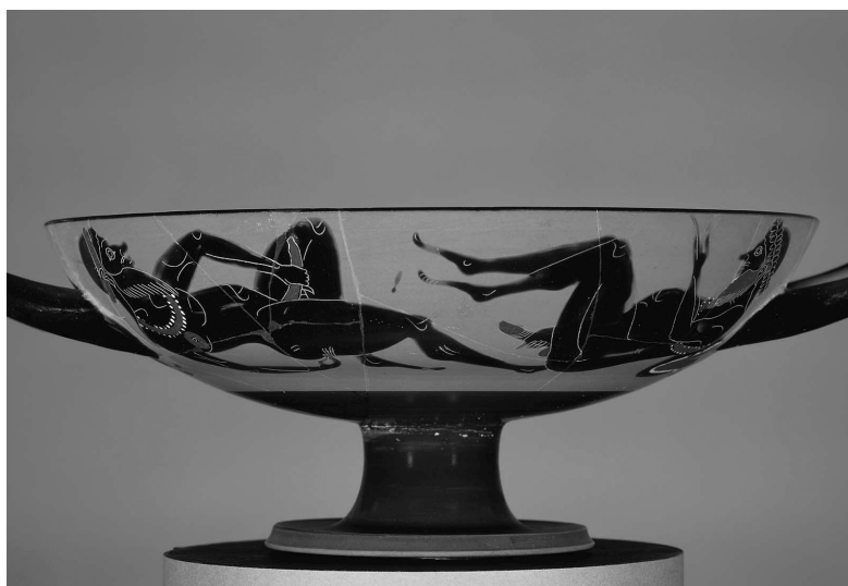
Figure 8. Two satyrs masturbating amicably

hidden beneath its prepuce, and tipped by an elongated akroposthion . Timothy McNiven has shown that Greek art associated the small phallus with the characteristic of sophrosyne , or self-controlled moderation, the very characteristic that satyrs notably lack. 28 A red-figured vase attributed to Douris around 500 to 490 BCE depicts a satyr balancing a drinking cup on his large, erect phallus during a symposion . Note that the ideal of the akroposthion is observed, despite the satyr's erection; and it is in fact the rigid akroposthion that supports the drinking cup: a feat possible only in the artistic imagination. (see fig. 9)