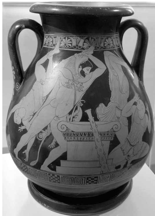
Figure 3. Herakles defeats the Egyptian king, Busiris, and his priests

In contrast, the partially exposed glans of the penis, deficient or lacking with respect to the prepuce, could be depicted by Greeks and Romans to indicate the foreign, and therefore barbaric, “other.” According to Herodotus, Colchians (from the eastern shore of the Black Sea, in present-day Georgia), Egyptians, Phoenicians, Syro-Palestinians, and Ethiopians practiced circumcision; although, he indicates, some Phoenicians abandoned the practice under Greek influence ( Histories 2.104.2–4). An Attic red-figure amphora attributed to the Pan painter around 470 BCE depicts Herakles defeating the Egyptian King Busiris and his priests. The vase recalls a story otherwise attested by Isocrates ( Busiris 31, 36–37) in which the Egyptian king, rather than welcoming strangers with hospitality, instead sacrificed them to the gods of Egypt. Herakles, outraged by such inhospitable treatment, killed Busiris and his entourage. As Hodges notes: