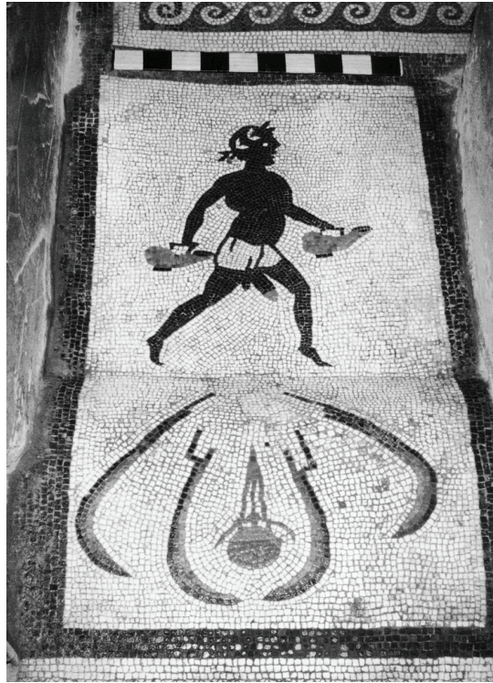
Figure 4. Ethiopian bath attendant with large phallus and exposed glans; House of the Mendander, Pompeii

envy and malice by evoking laughter. 17 Clarke notes that the Ethiopian's "un-Roman body type caused laughter—all the more so when he had an enormous phallus." 18 We may add that the comedic value of the image is enhanced by the slave's indecorously exposed glans—a point to which we will return. In the mosaic, the glans penis is colored with purple tesserae, emphasizing its exposure. 19