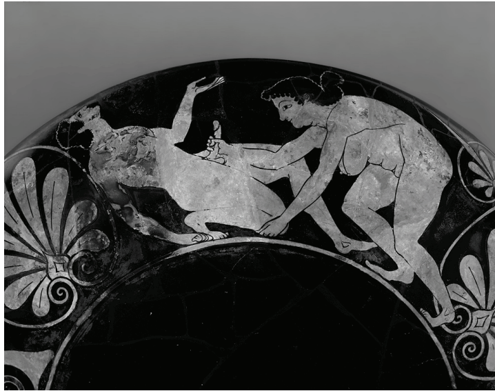
Figure 7. Woman prepares youthful male for intercourse; the glans of the young man's phallus is exposed (Source: "Attic Red-Figure Kylix," side A, Phintias, c. 510 BCE, The J. Paul Getty Museum, Villa Collection. Digital image courtesy of the Getty's Open Content Program.)

example, depicts a beardless youth being prepared by a female, perhaps a prostitute, for irrumation (fellatio) or, more likely given the postures of the two figures, to be mounted. The female grasps the right knee of the man, instructing him to assume a sexual posture with his legs bent beneath him, weight borne on the balls of his feet, while in her right hand she grasps his erect phallus, glans exposed.