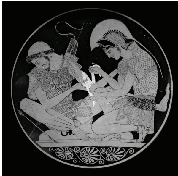
Figure 1. Achilles binds the wound of Patroklos

As Hodges points out, the Greek beauty ideal that required the glans penis to be amply covered by a long, tapering foreskin is evident, for example, in the depiction of the binding of Patroclus's wound by Achilles on a vase attributed to the Sosias painter, who was active around 510 to 490 BCE. 8 The younger, beardless Achilles wraps a bandage around the left arm of the older, bearded Patroclus, whose arm had evidently been pierced by the arrow pictured resting at an angle just below his right shin. 9 Patroclus's akroposthion , the Greek term designating the portion of the prepuce that extends beyond the tip of the glans, is shown elegantly draped over his right ankle.