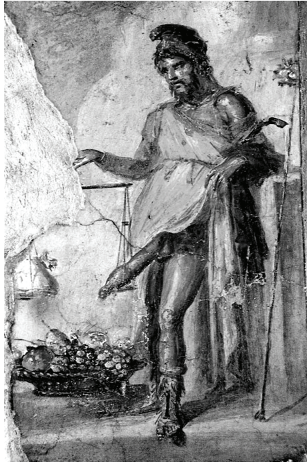
Figure 11. Priapus with phallus on scale; fresco, House of the Vettii, Pompeii

the Vettii is attributable to the beneficial influence of the god and by evoking laughter. In spite of its comedic proportions, the phallus of Priapus retains its decorum, as the glans remains hidden beneath the akroposthion .