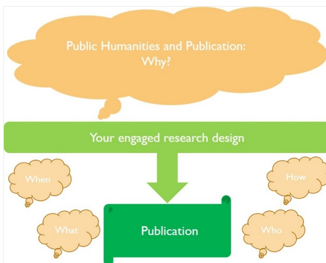
Publication objectives for engaged research in the humanities

Thinking differently about publicly engaged practices and publication is a facet of this working paper. Within this context we pose some broader questions about the nature of publicly engaged scholarship and publication and recognize that thinking differently about the humanities is much broader than publication alone, not least in how we collectively address diversity, equity and inclusivity in our work and publications. Conversations within and beyond publicly engaged scholarly communities are engaging with these issues and there is more work to be done specifically to address the ethics of publicly engaged and racial and regional diversity, as well as the significant role that scholarly societies, librarians and funders play in addressing the growth of public and publicly engaged humanities.