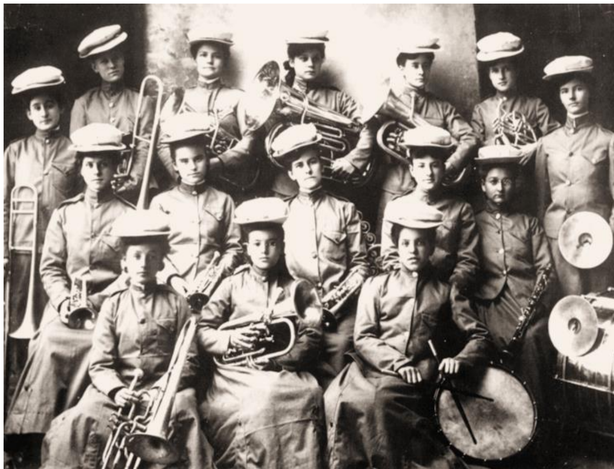
Perkins Ladies' Band, Guthrie