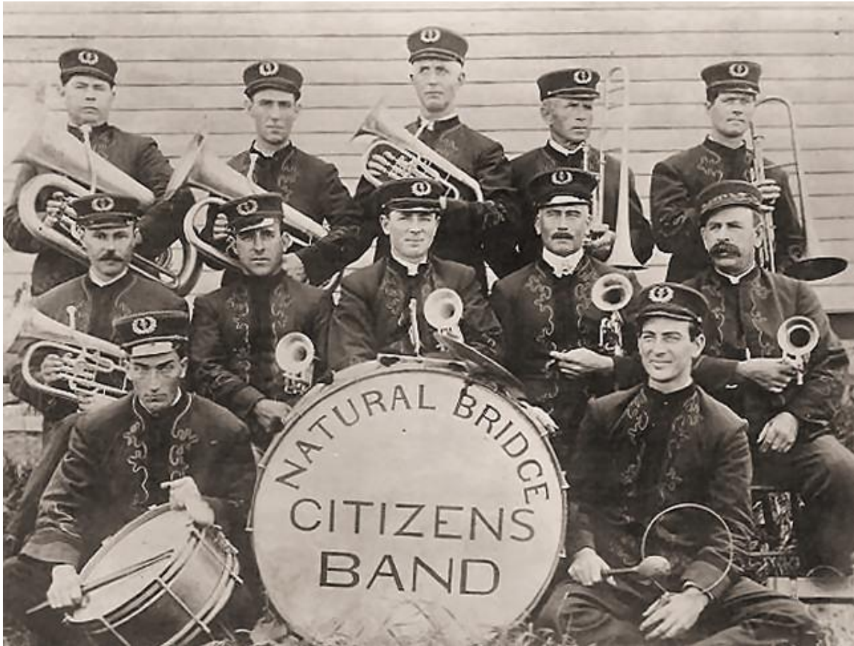
Natural Bridge Citizens Band