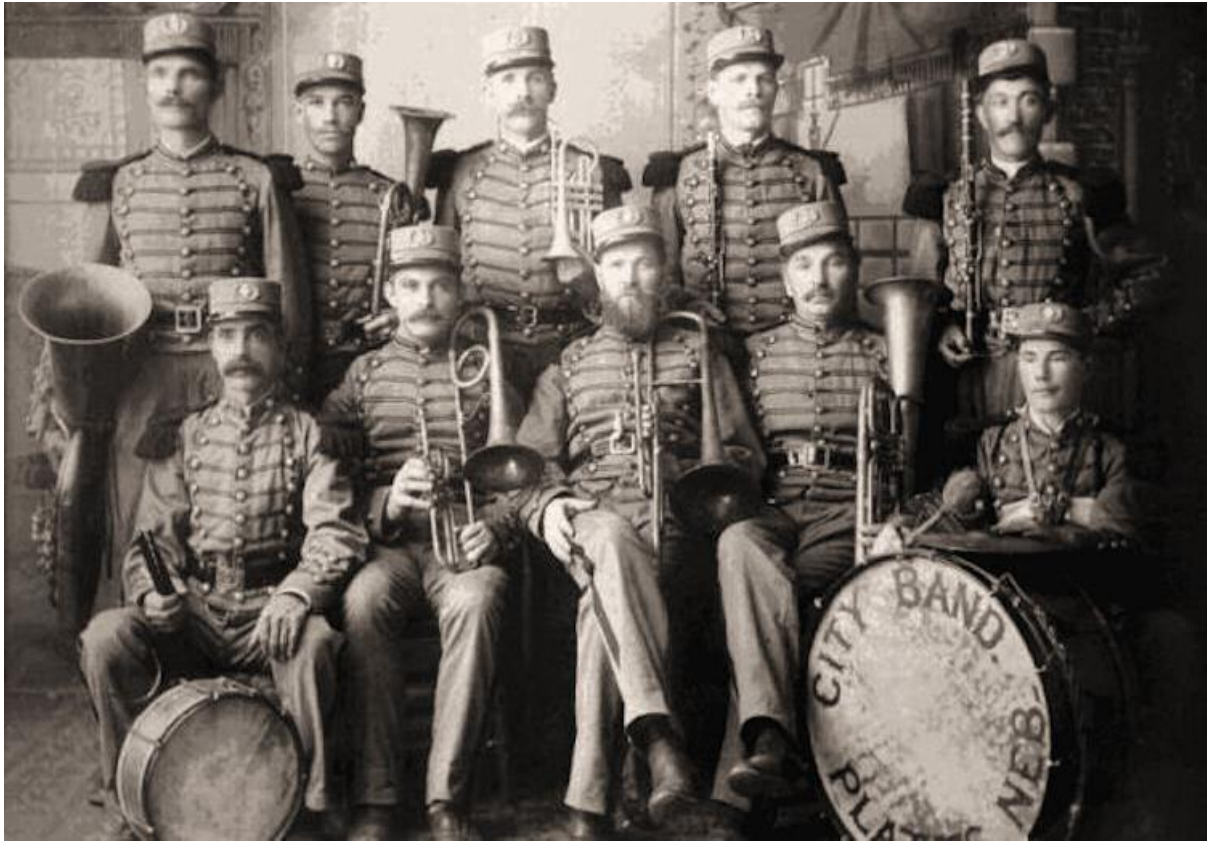
Platte City Band