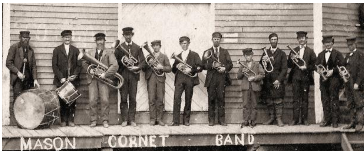
Mason Cornet Band, 1874