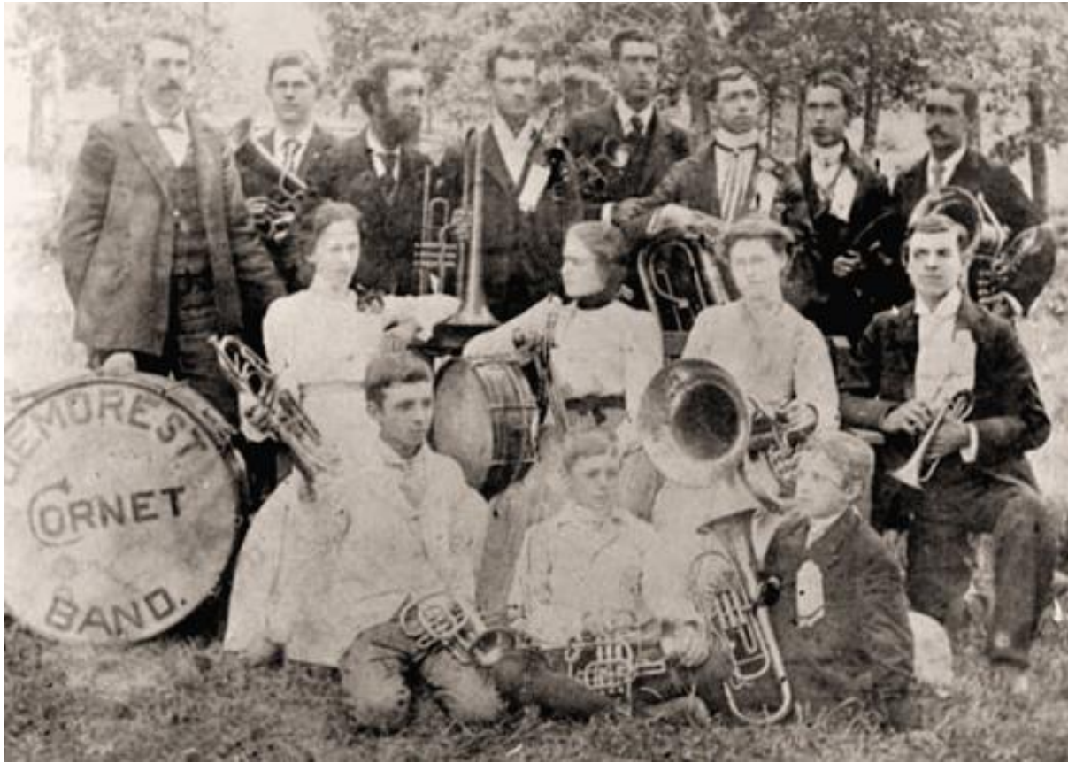
Demorest Cornet Band