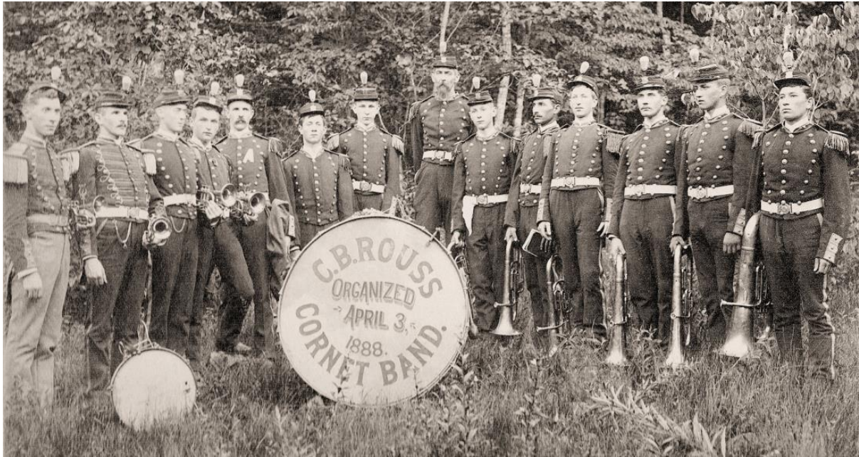
C.B. Rouss Cornet Band