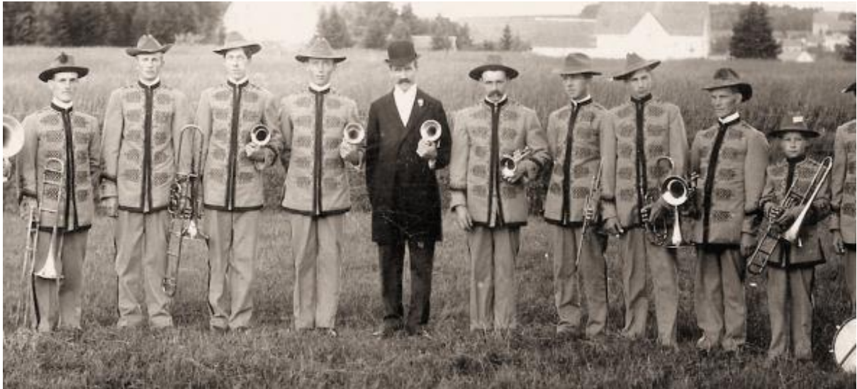
New Sweden Band