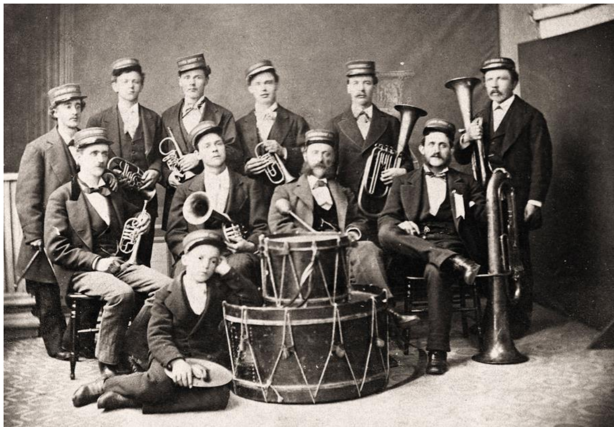
Olympia Cornet Band