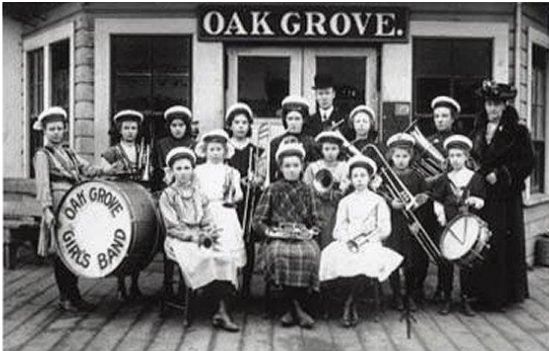
Oak Grove Girls' Band