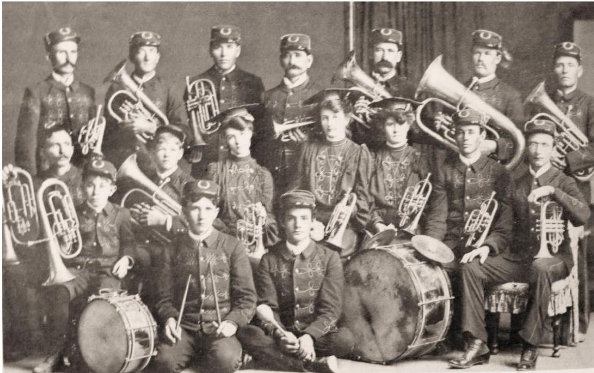
Sterling Brass Band

These bands are either those that had no fixed base or location (e.g. travelling, circus bands etc.) or those for which the location and/or state is unknown or ambiguous.