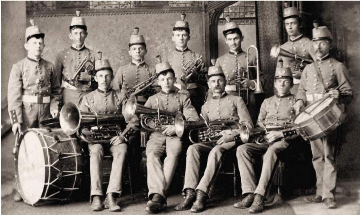
Kokosing Cornet Band, Gambier, 1886