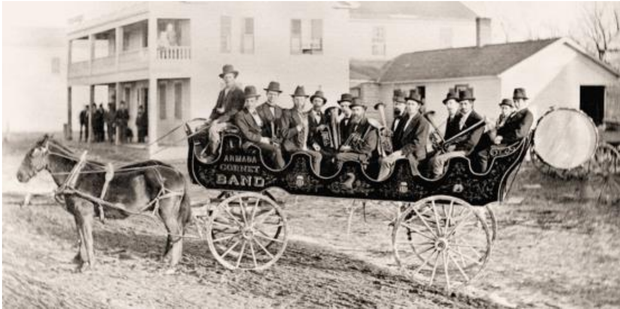
Armada Cornet Band