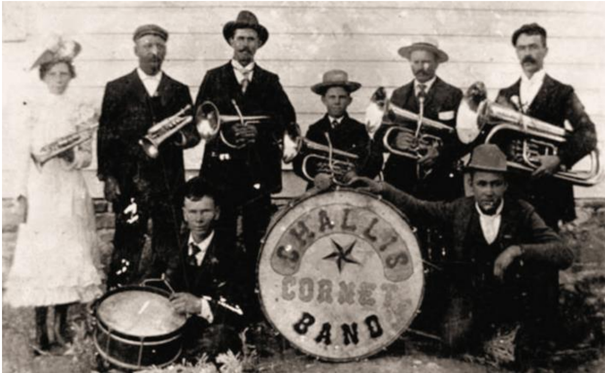
Challis Cornet Band