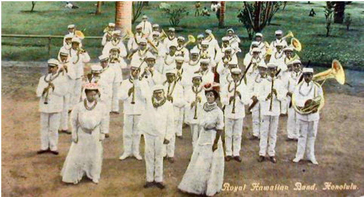
Royal Hawaiian Band, Honolulu, 1907