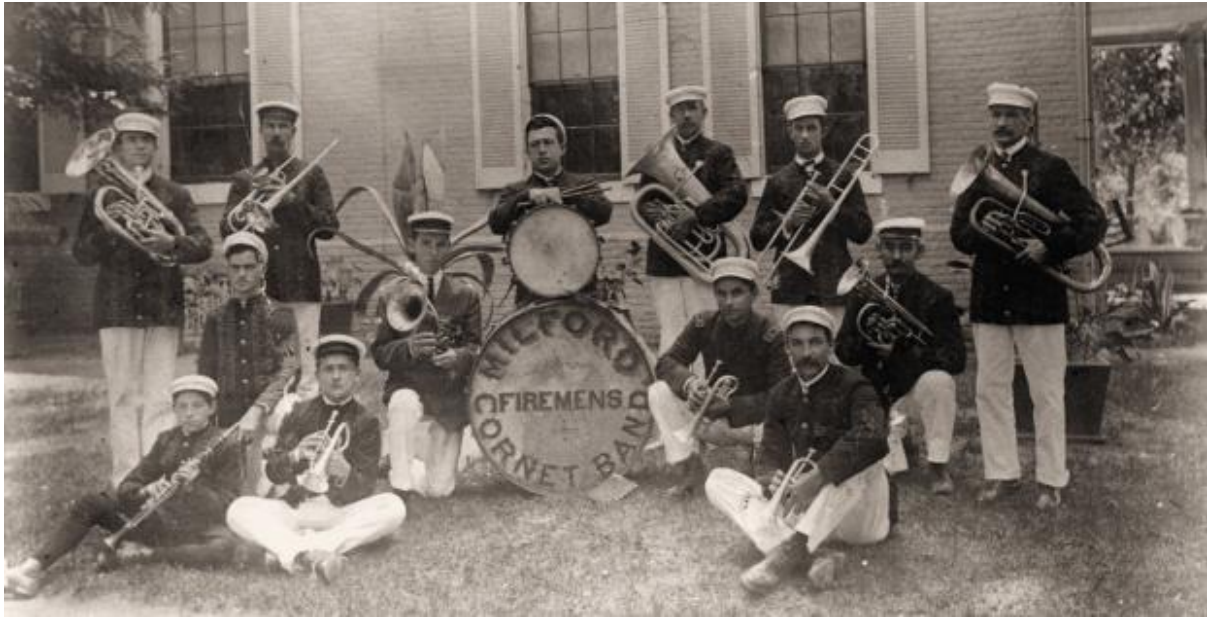
Miford Fireman's Cornet Band