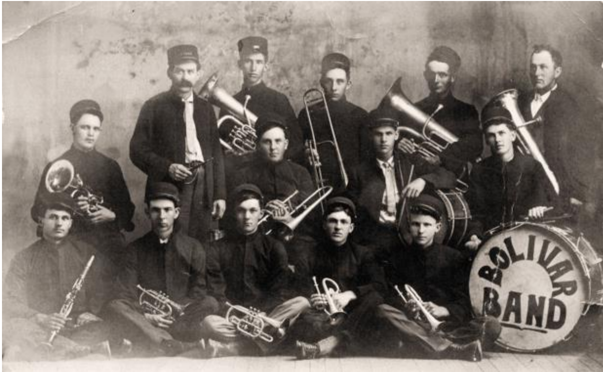
Bolivar Brass Band