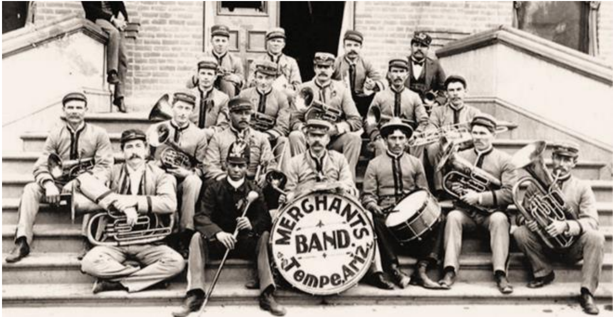
Merchant's Band - Tempe