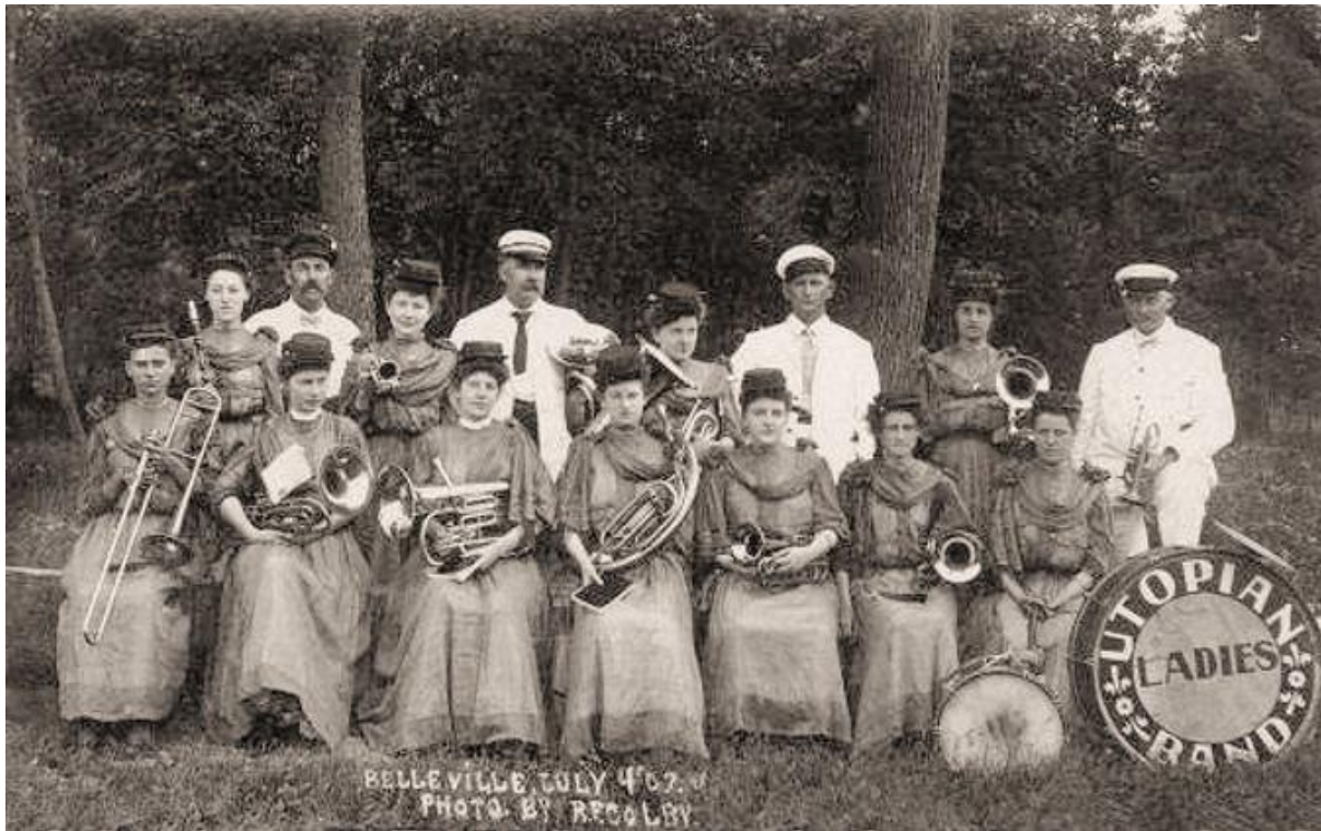
Utopian Ladies' Band, Belleville, 1907