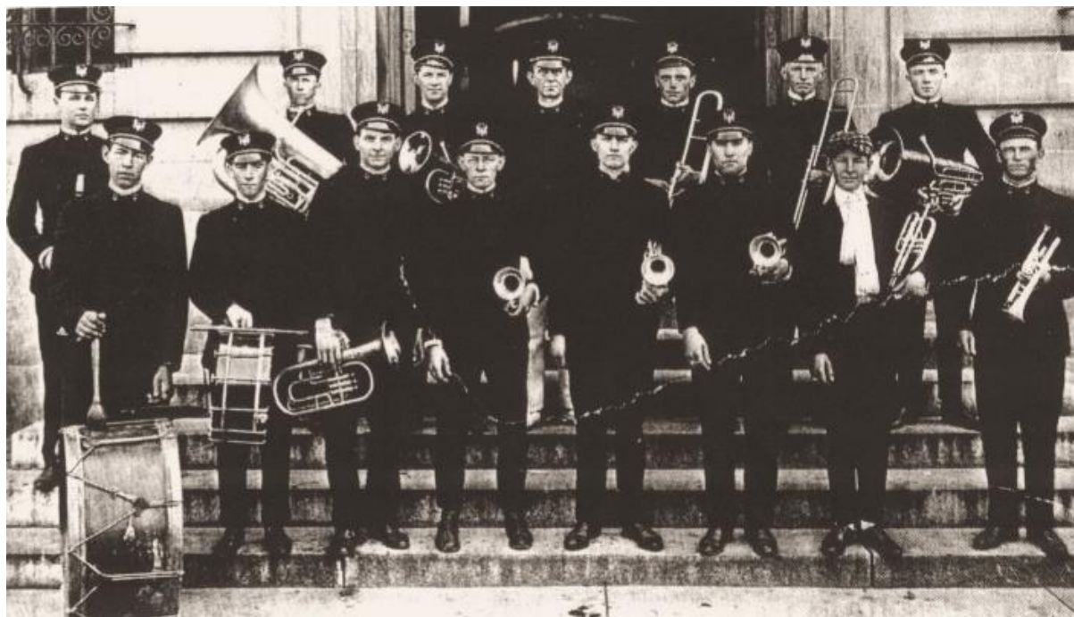
Culleoka Brass Band