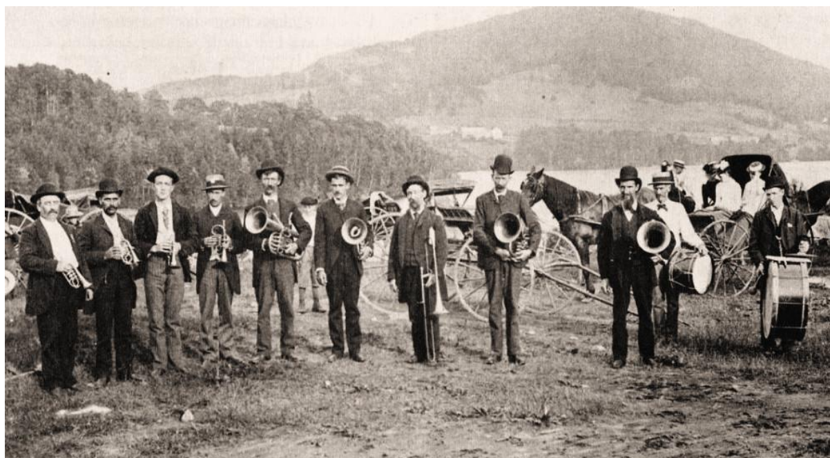
Barnet Brass Band