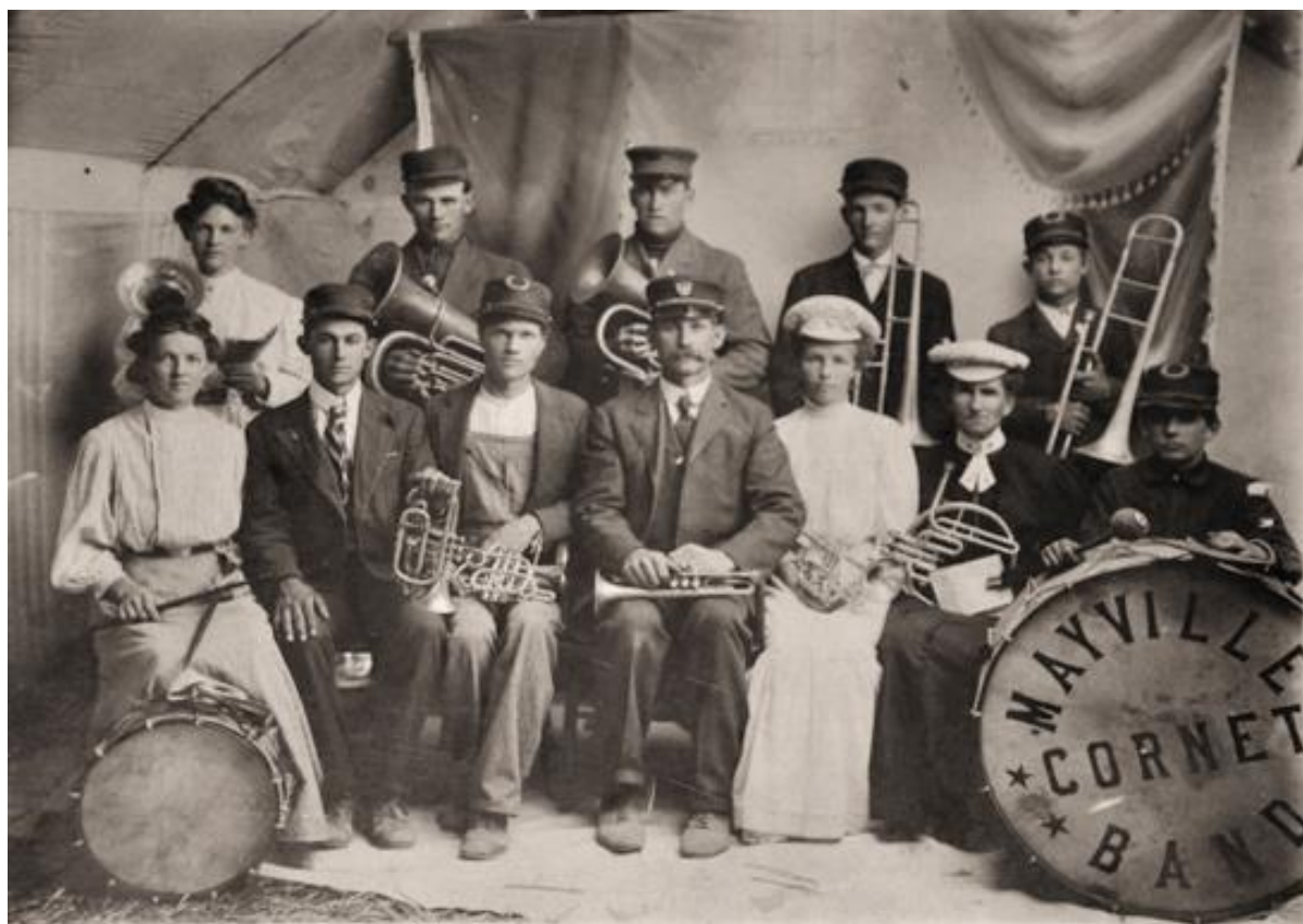
Mayville Cornet Band