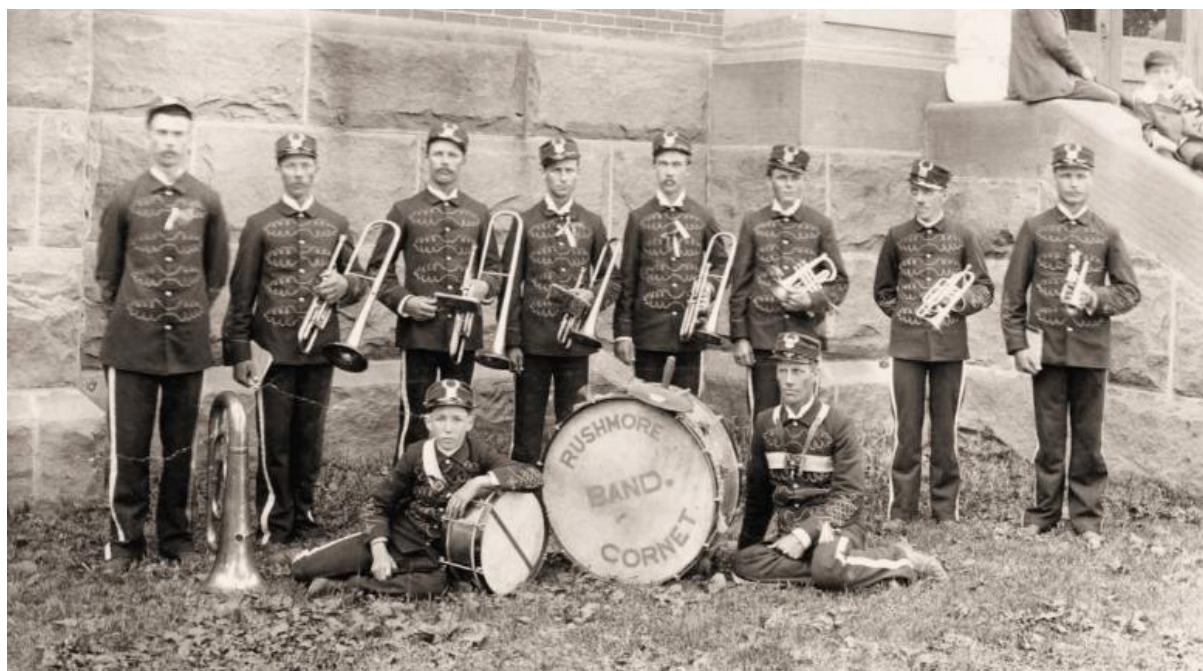
Rushmore Cornet Band