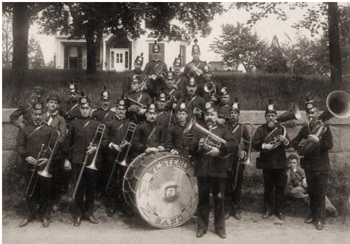
Westerly Band, 1885