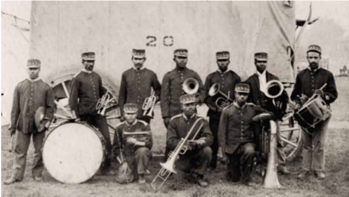
Sell's Brothers Side Show Band, 1884