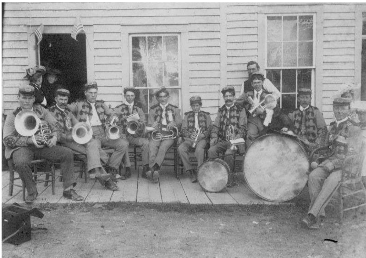
Sheridan Silver Cornet Band