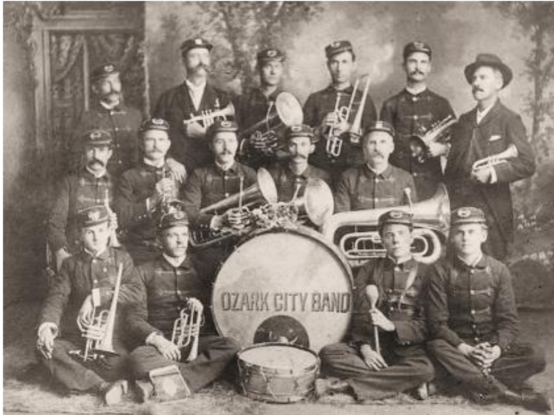
Ozark City Band