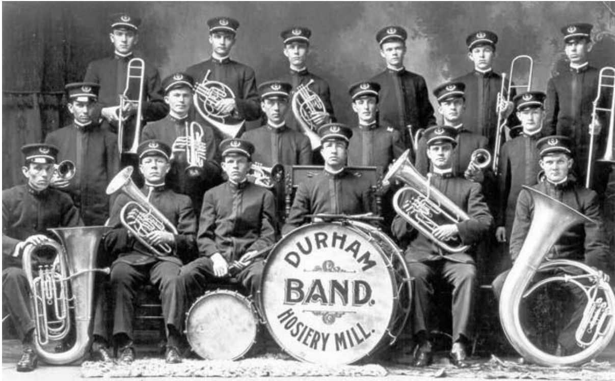
Durham Hosiery Mill Band