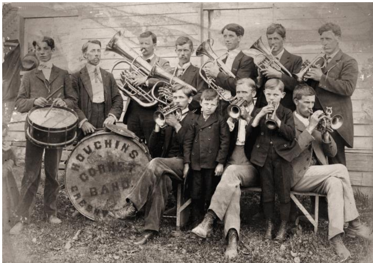
Houchins Cornet Band, Greenville