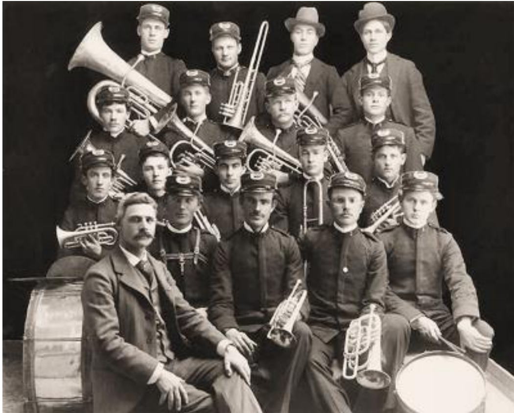
Montrose Band, 1905