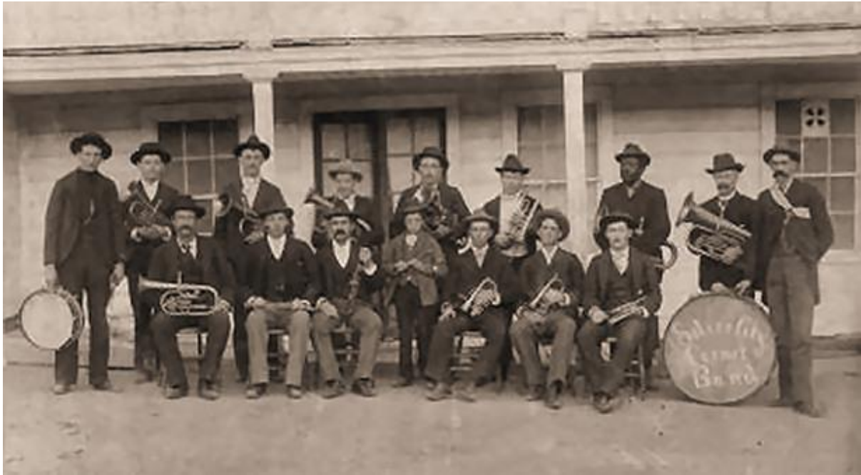
Silver City Cornet Band