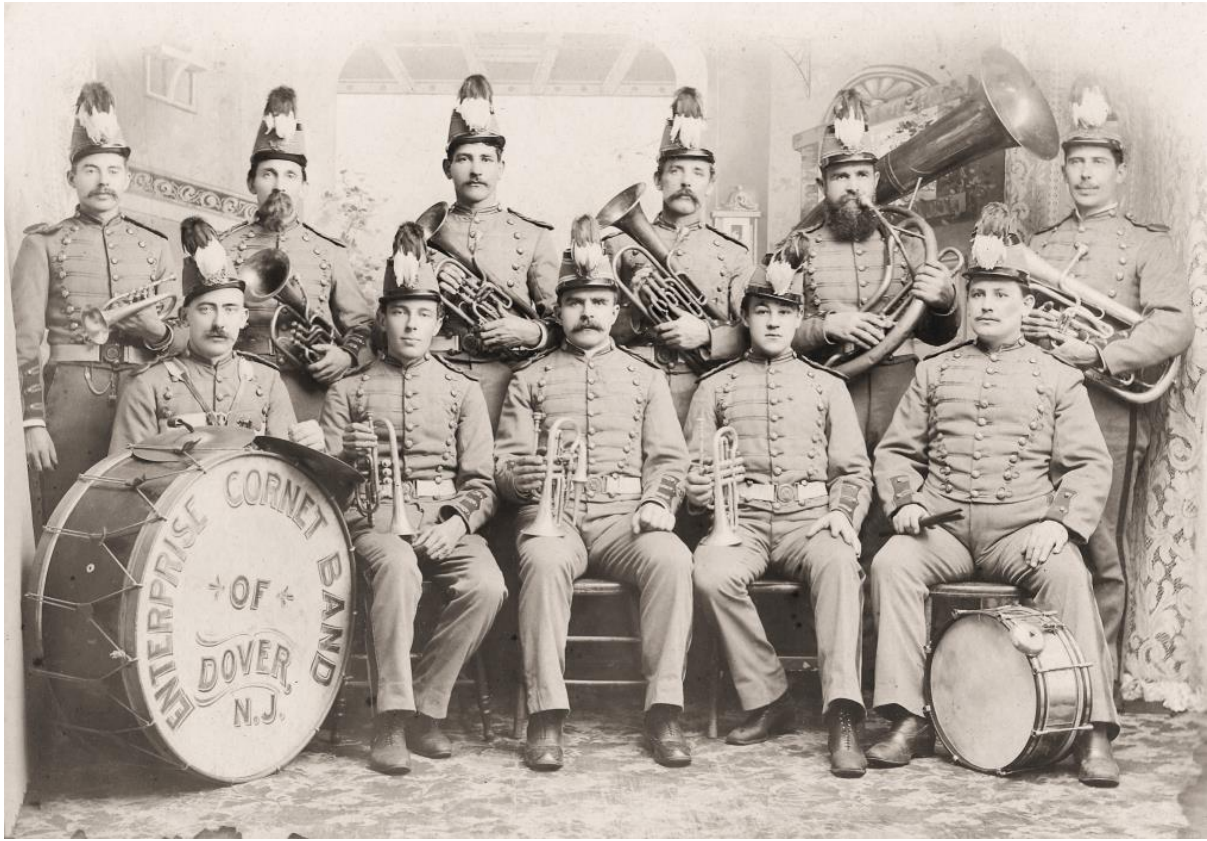
Dover Enterprise Cornet Band