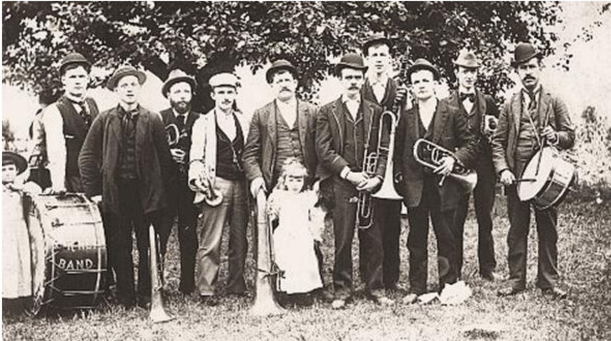
Thompsonville Cornet Band