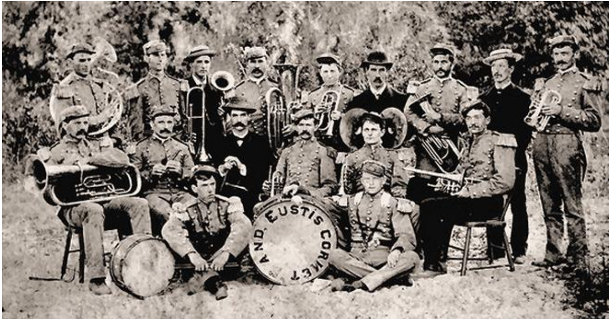
Eustis Cornet Band