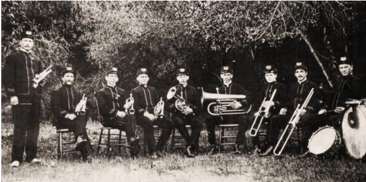
Monticello Band, 1905