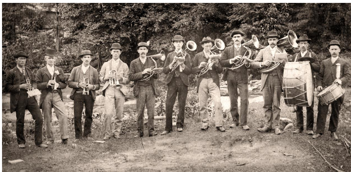
Unknown cornet band