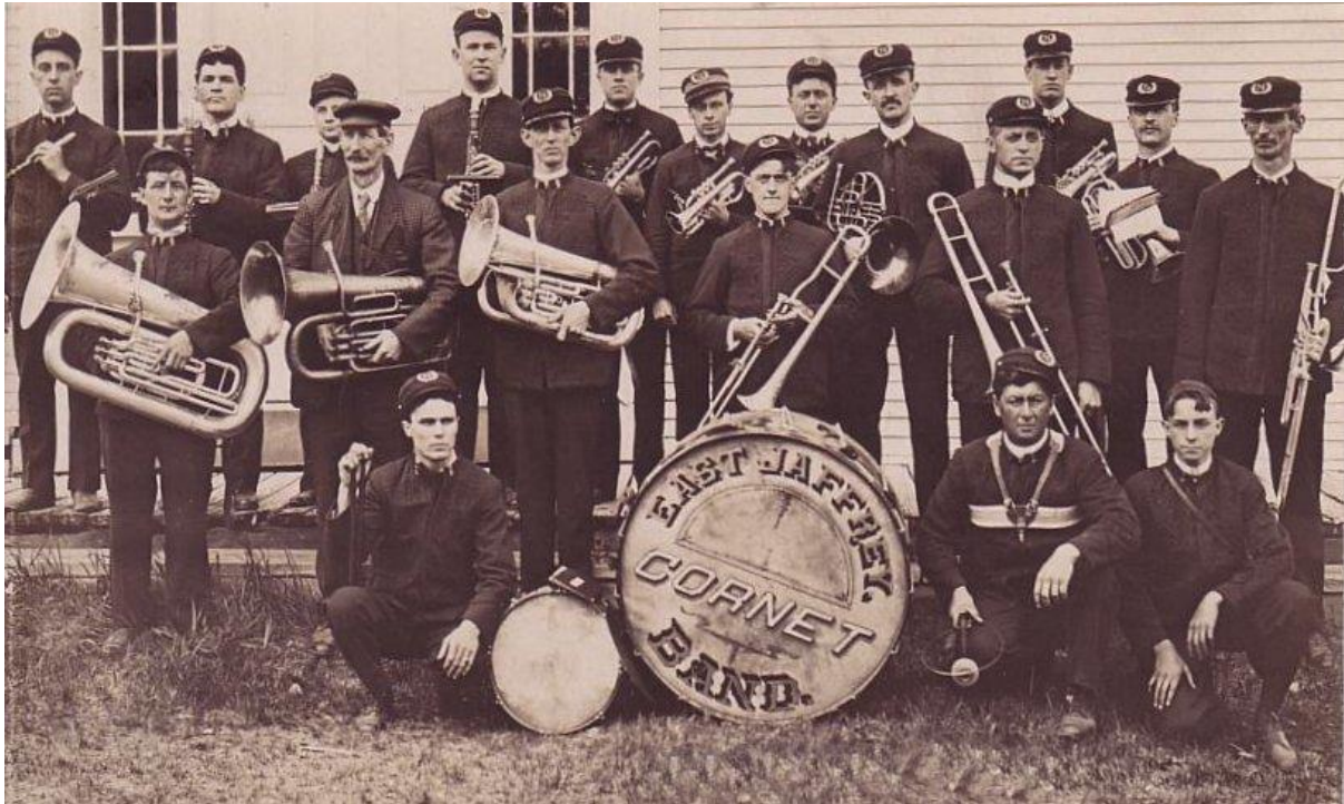
East Jaffrey Cornet Band