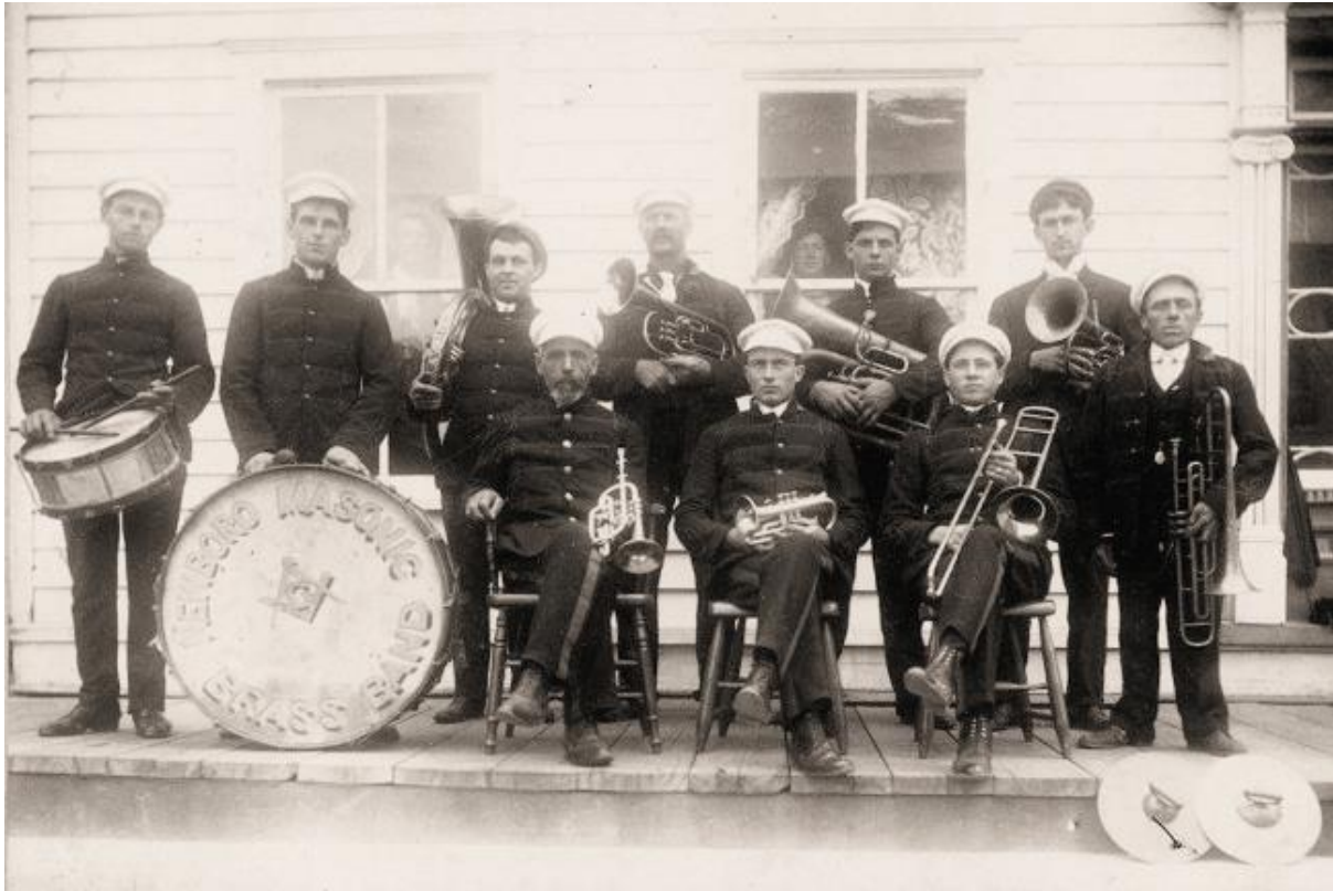
Newboro Masonic Brass Band, 1912