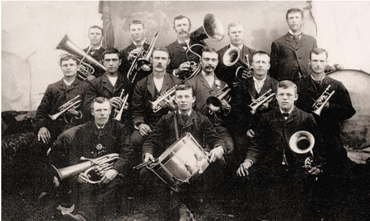
Morgan Brass Band