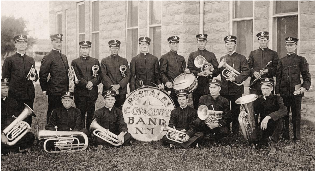
Portales Concert Band