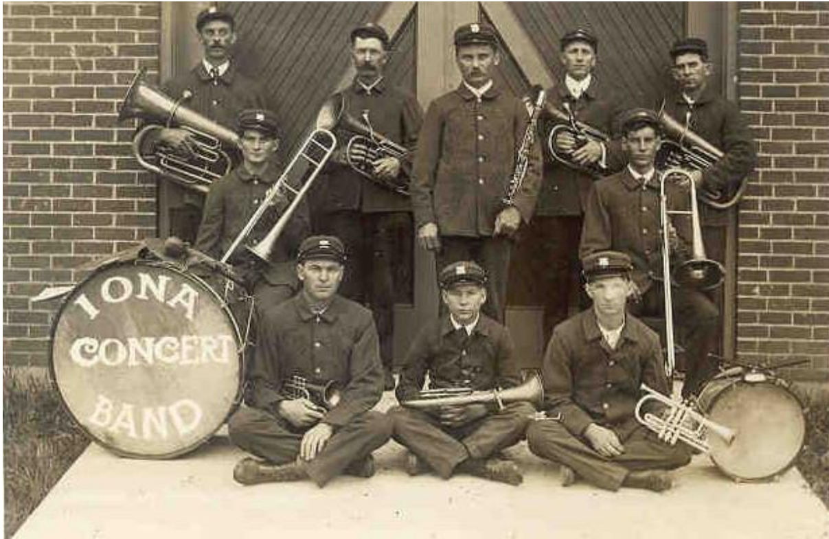
Iona Concert Band