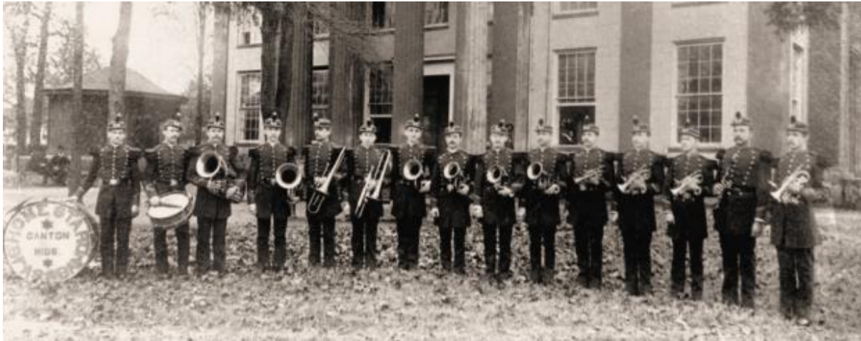
Canton Home Star Brass Band