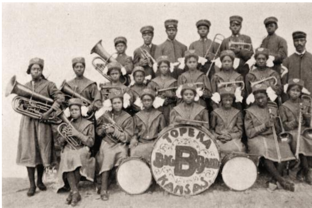
Topeka Big B Girls' Band