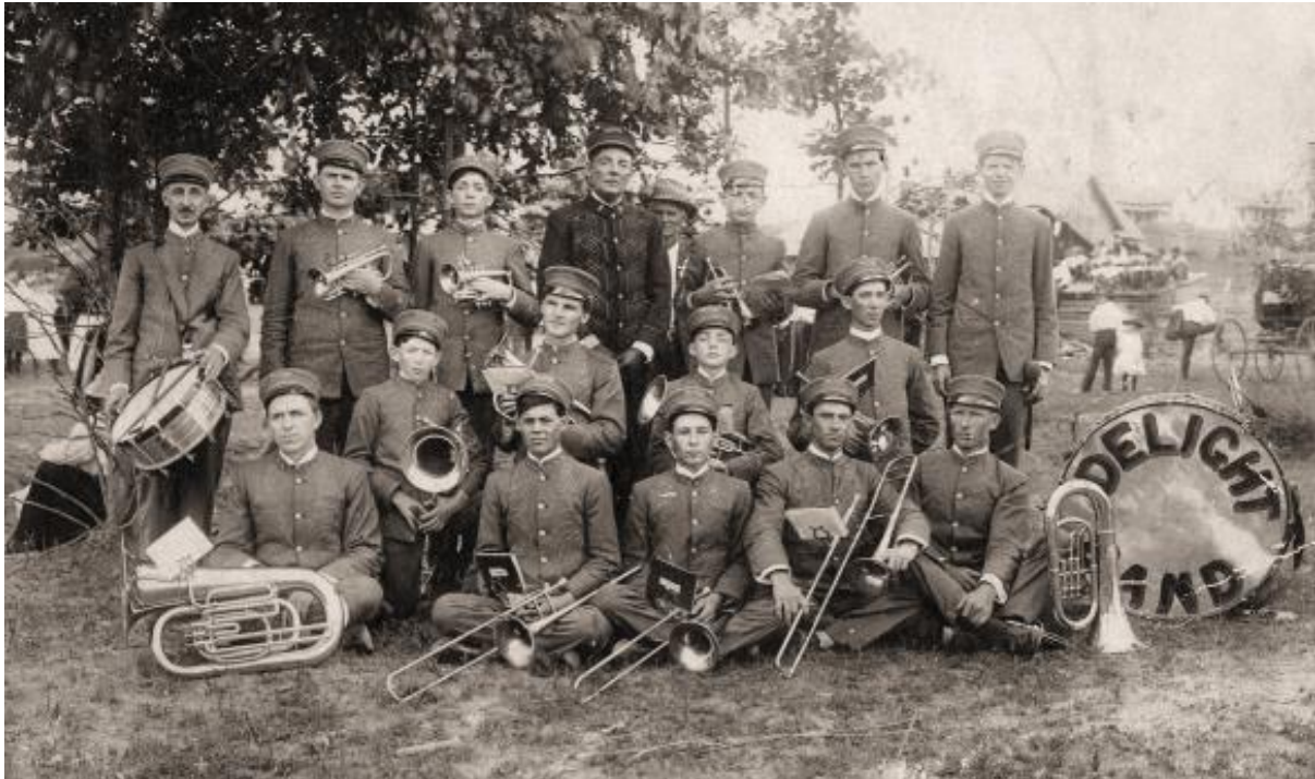
Delight Brass Band