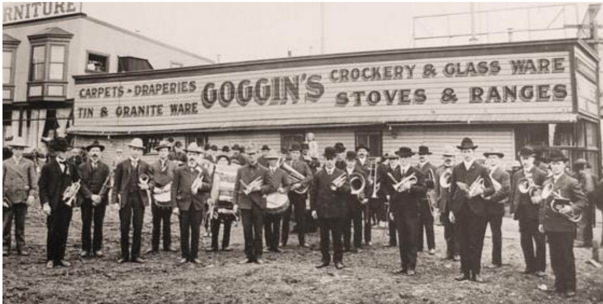
Nome Brass Band