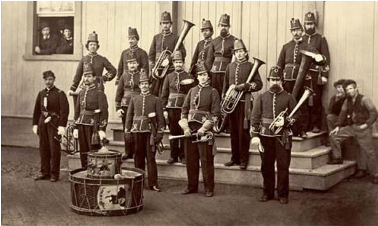
9th Veteran Reserve Corps Band, Washington, 1865