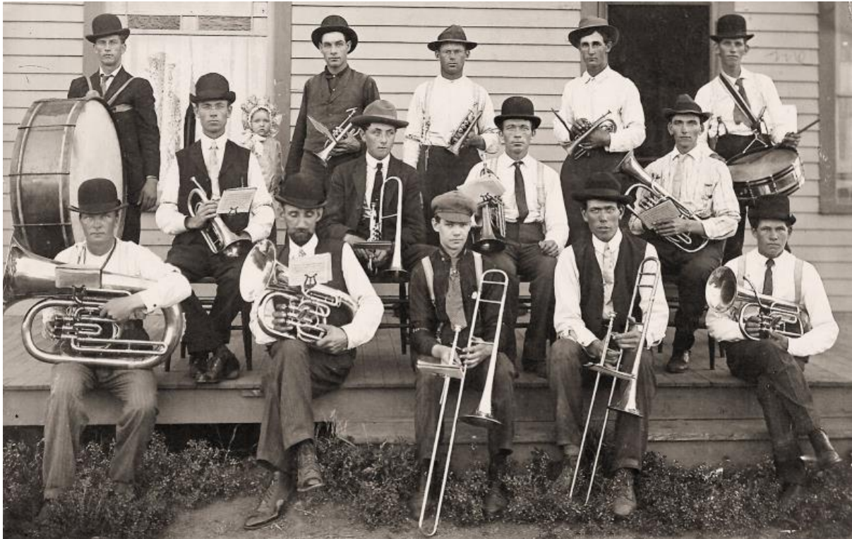
Landa Brass Band, 1910