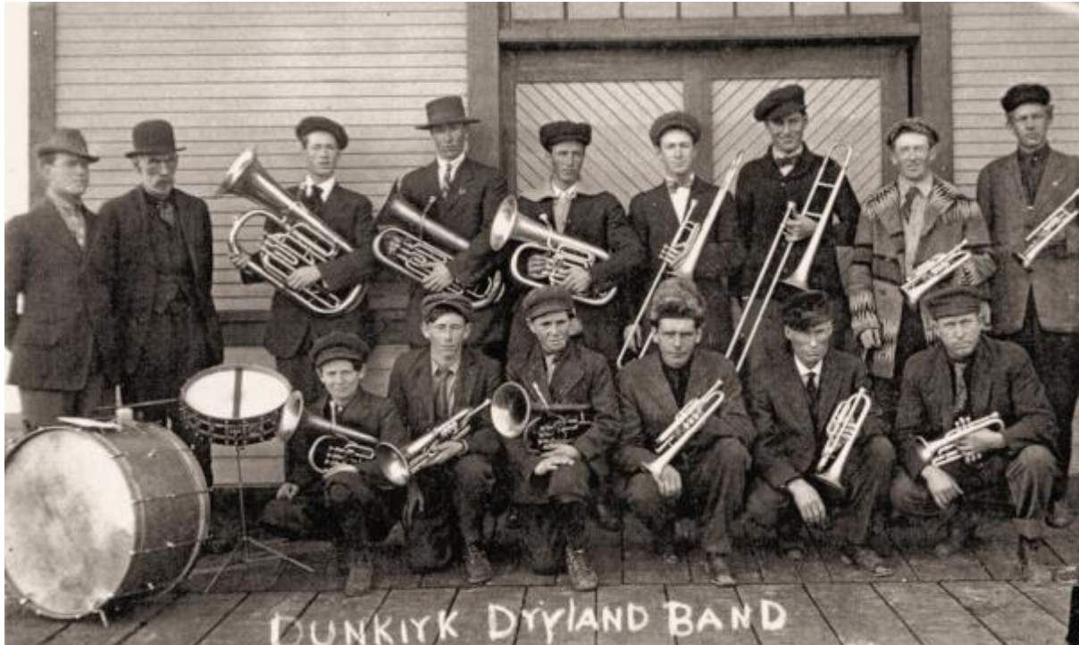
Dunkirk Dryland Band