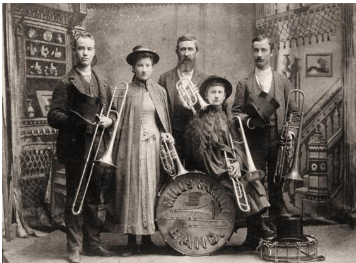
Mills Family Band, Cedar Falls