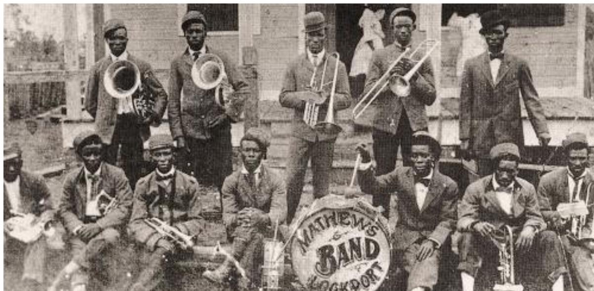
Mathews Band, Lockport