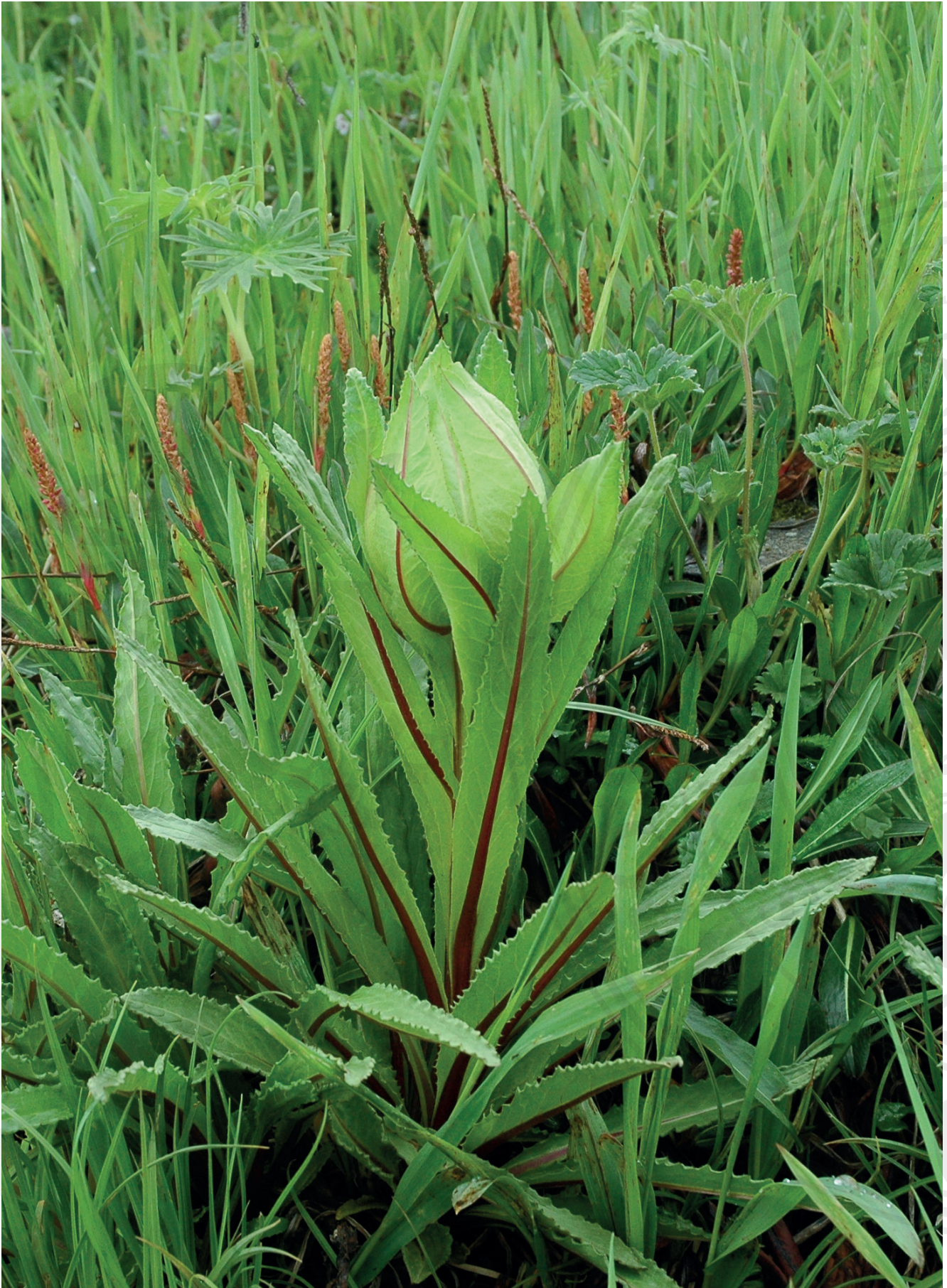
The prominent bracts of Saussurea obvallata protect its inflorescences which attract insects by their strong citrus-like scent. S. obvallata has culinary and medicinal uses, but it is best known for its religious significance; it is said to be the lotus which is always depicted with the Hindu god Brahma. Api Himal, 4,200 m, 29°57'N/80°57'E, July 2012. (CP)