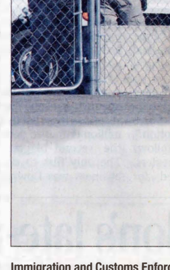
ers for potential deportation and Immigration and Customs Enforcement agents lead detainees to a specially convened court at Electric Park Ballroom on the National Cattle Congress began building a case against the grounds in Waterloo on May 15, 2008. Eventually, 306 people detained on immigration charges in Postville were deported to their home countries.

who was in the country illegally and working at Agriprocessors.