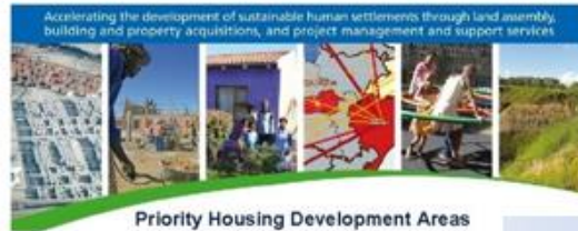
Priority Housing Development Areas