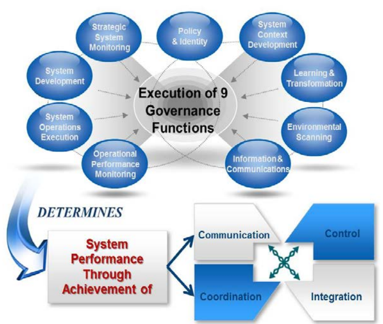
Exhibit 2. System Functions for CSG.

From this conceptual grounding in Systems Theory and Management Cybernetics, CSG is formulated as the "design, execution, and evolution of the [nine] critical metasystem functions necessary to maintain system viability [existence]" (Keating, et al., 2014) (Exhibit 2).