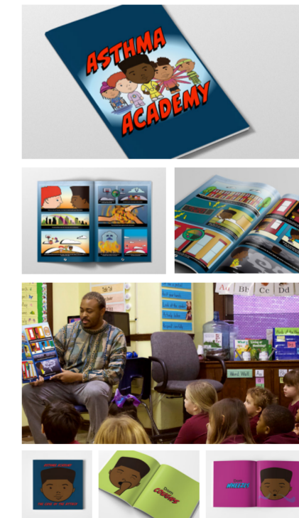
ASTHMA ACADEMY - Children & Asthma