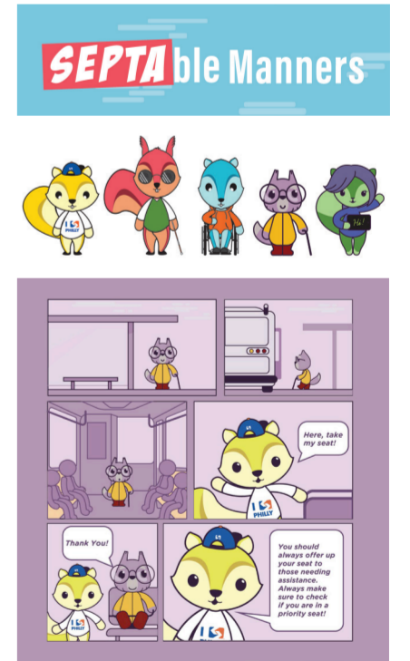
SEPTABLE MANNERS - Public Transportation & Manners