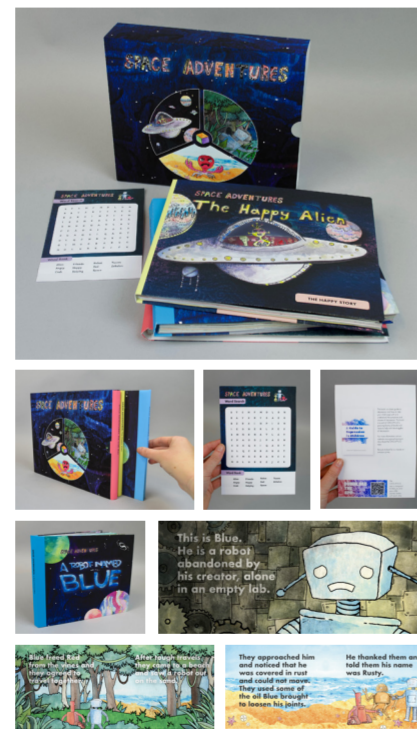
GROUPHUG - Children & Anxiety/Depression