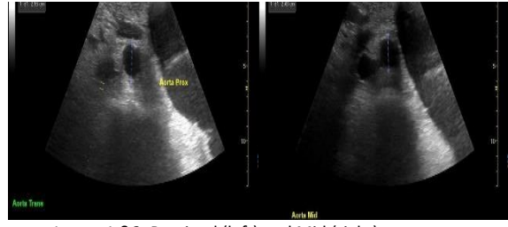
Image 1 &2. Proximal (left) and Mid (right) transverse measurements of the aorta.

Patient had vitals of 185/100, temp of 99.2F, pulse of 83, and SpO2 of 97% on room air. His bloodwork did show that he had a significant leukocytosis of 21.5. His creatinine was 1.09 which was at baseline. Urinalysis showed proteinuria, blood, and trace leukocyte esterase. Microscopic urinalysis revealed WBC of 11-10. A point-of-care ultrasound of his abdominal aorta was performed to evaluate for possible aortic aneurysm . During the scan, a large contained, fluid collection was visualized adjacent to the aorta on proximal and mid transverse views of the aorta.