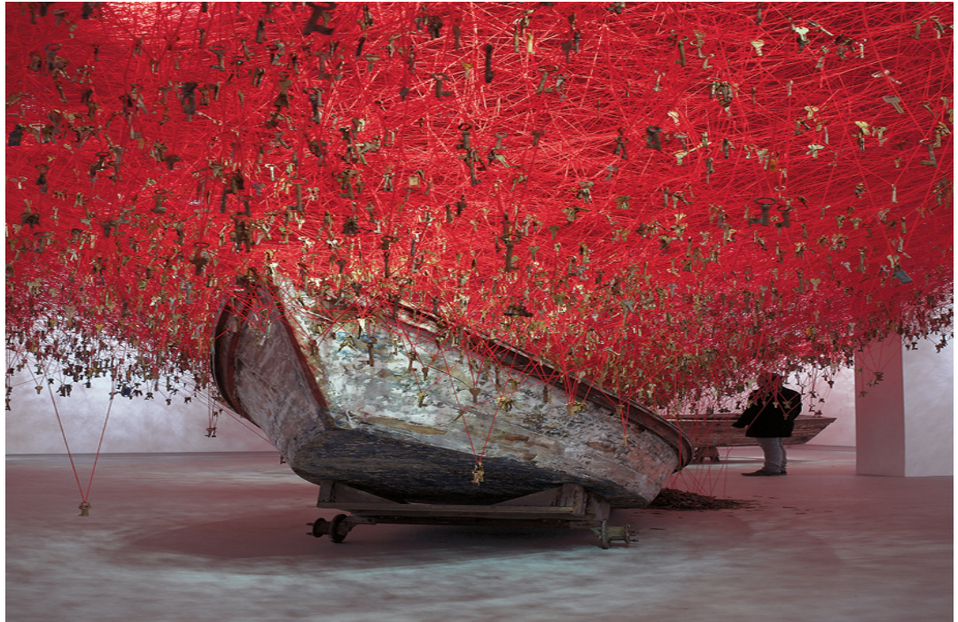
Fig.10. Chiharu Shiota, Weaves an Immersive Labyrinth of Keys and Yarn

my work shows the exclusion, persecution and strangulation of white butterflies by red butterflies. 13