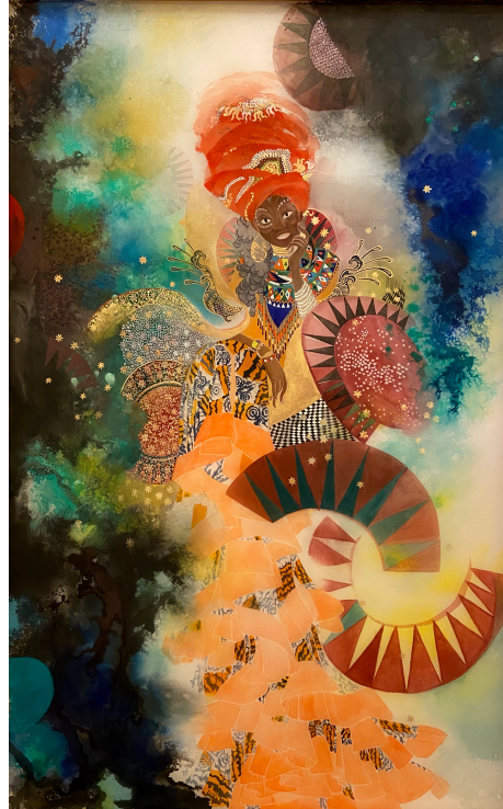
Fig.4. Licia I , Ink and watercolor on silk

geometric patterns. To do this, I carefully arranged the patterns one by one, dipping a small brush directly into tubes of thick, unwatered Japanese watercolor.