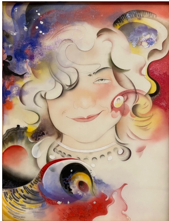
Fig.6. Butterfly Women , Ink and watercolor on silk

I used red as the main color in the picture to show the main impression she left on me—warm and cheerful. Yellow represents the joy she brings to those around her. Black represents the dark side of her life where she is worried and wronged. A metal necklace with teeth represents her current free-flowing look. In the middle of the picture is her young face with a sweet smile. Patterns with curved lines represent her liveliness.