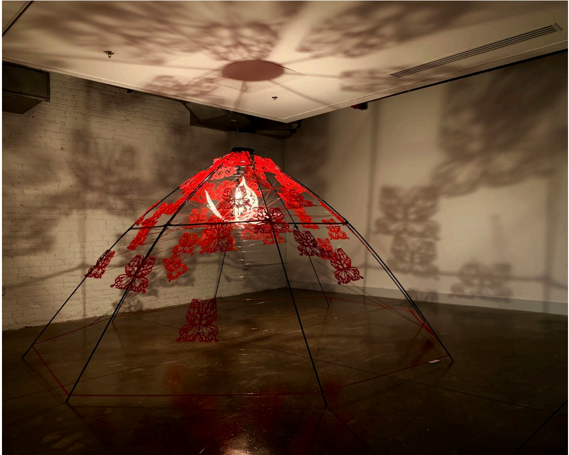
Fig. 8. Kill a Butterfly , Resin, iron, thread, yarn, light, and paper

of crisscrossing red threads threading a luminous white hollow butterfly. And the light from the white butterfly casts the shadow of the red butterfly on the dome's surface onto the white walls around the dome.