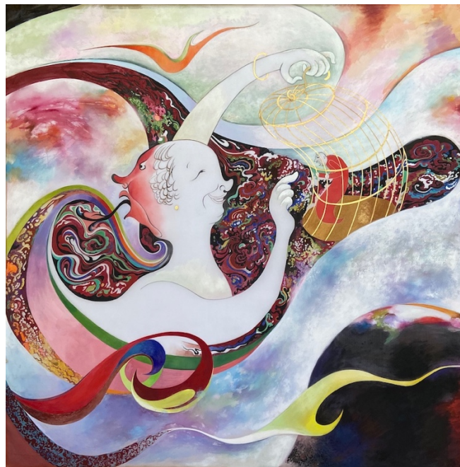
Fig.3. It is for Your Sake 2 , Ink and watercolor on silk

In the second picture (fig. 3), the mother holds a cage and plays with the child in the cage with her other hand. Ignoring the pain of the caged child, she revels in the joy of being in control.