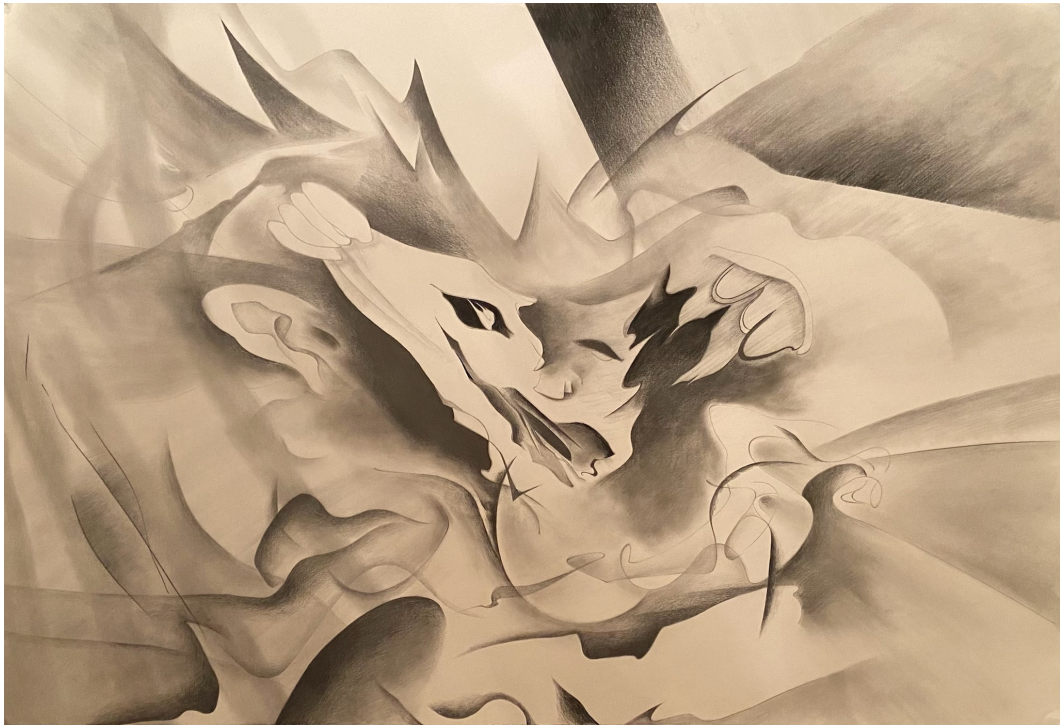
Fig. 7. Tear , pencil on paper

technology became the most important or only way to connect and maintain relationships between people. Technology became the outlet for people living alone through the pandemic in self-isolation. However, there were groups of people that had to cohabitate and isolate together during the pandemic. Many families and roommates spent more time together than ever before, working and studying around each other. New conflicts and perceptions came about due to this constant close contact, as illustrated in my piece Tear (fig. 7).