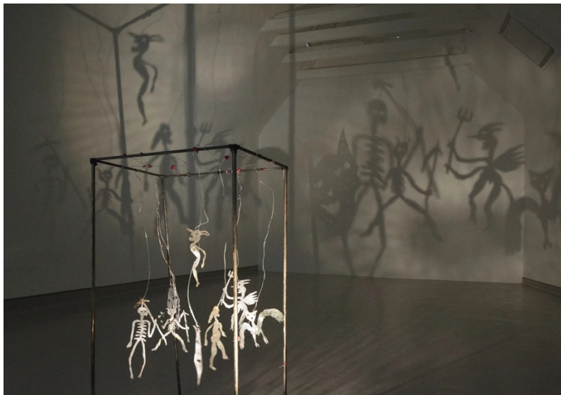
Fig.11. Christian Boltanski, Theatre D'ombres

This project may bring an increased awareness of how one may feel to be judged by many thereby educating the viewer. 3-D art is used to convey the connection between how many individuals may be influenced unknowingly by outside sources while passing judgment on the one that may hold a differing view. This installation will also show how art may continue to educate and inform on levels that reach the human psyche where other means go unnoticed. Influences of judgment placed on individuals knowingly or