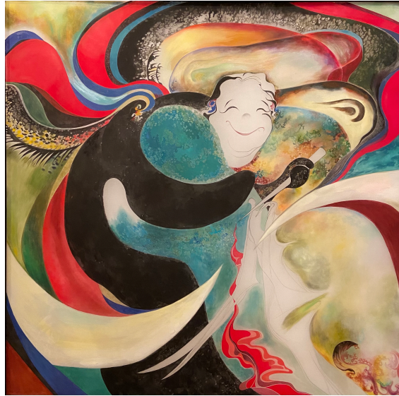
Fig.2. It is for Your Sake 1 , Ink and watercolor on silk

terrifying. It raised a question of how to build healthy and loving relationships between parents and children?