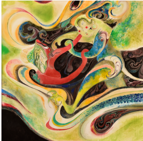
Fig.1. Struggle , Ink and watercolor on silk

do not have the happy life they deserve. Out of situations of need, she always received help from her relatives and friends. As a result, she is always careful to show her best side out of the fear of offending others and getting a bad reputation within her community. She was always treated unfairly and hurt by those around her, even though she made constant efforts to be perceived as kind. As a sensitive person, she always felt