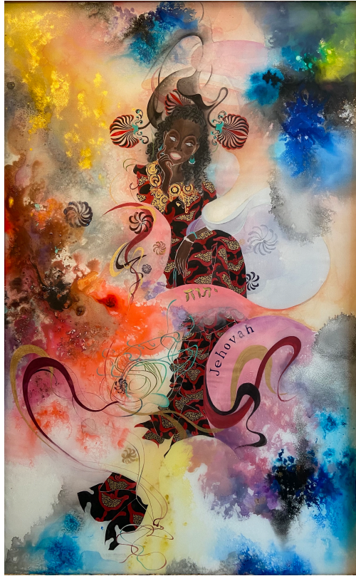
Fig.5. Licia 2 , Ink and watercolor on silk

spread to Africa from Europe during the African colonial period and became a favorite cloth-making technique of modern Africans.