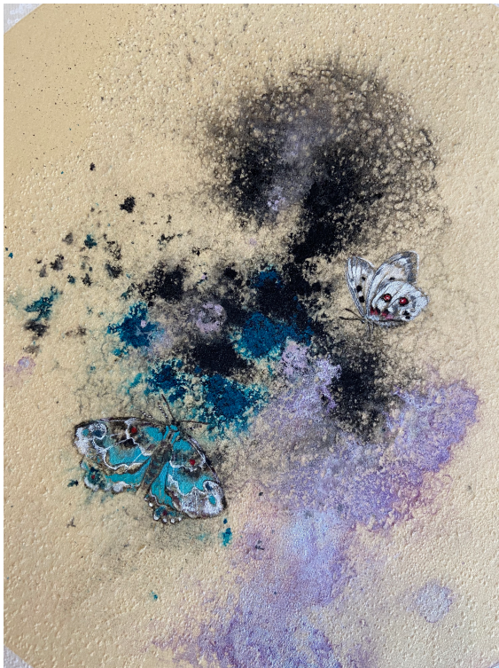
Fig. 12. Butterfly dream , Ink and watercolor on paper

Under great stress, we often unconsciously take out our emotions on the people closest to us. Especially during the isolation period, people's emotions and conflicts were infinitely magnified in the narrow space. Learning to ease our emotions without hurting ourselves and the people we care about becoming an important skillset moving forward. The spiritual realm of Lao and Zhuang in Chinese Taoism, which is pure, natural, and absolutely free, helps us calm down among this chaos. It emphasizes getting rid of the chaotic external world of the spirit and establishing spiritual independence and free expression of personality in the inner world. 16