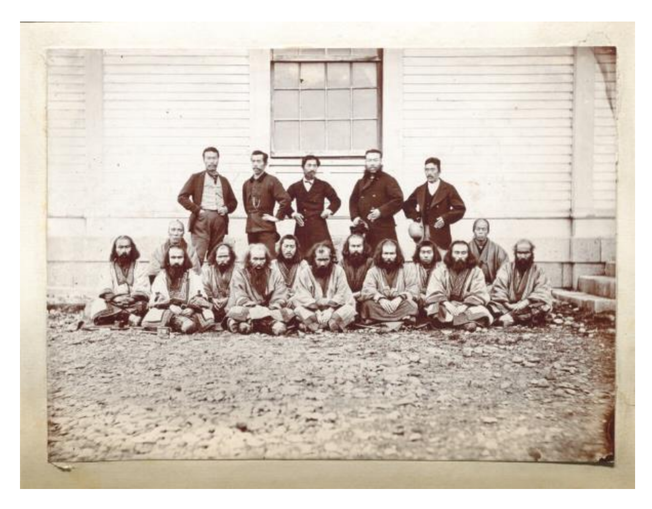
Figure 4 Sakhalin Ainu and Hokkaido Development Commissioners who emigrated to Hokkaido [1876] (Meiji Taisho period Hokkaido photo catalog (Meiji Taisho period Hokkaido catalog edition)).

Figure 4 above encapsulates every stereotype and perception built around the Ainu and the Japanese. Depicting the gathering of the Sakhalin Ainu immigrants and Meiji officials, the same atmosphere is captured that can be seen in Figure 2- an aura of submission and a physical boundary created between those on unequal footing. The officials depicted pose with a sense of pride while standing tall, while their Ainu counterparts sit slouched on the ground. What is remarkable about drawing similarities between Figure 2 and Figure 4 is that while the Japanese subjects depicted show a clear divide in time, the Ainu do not. While the Japanese subjects dress in both their respective Tokugawa and Meiji attire as one would expect for the time they are meant to represent, the Ainu look identical in both depictions. Images like Figure 4 likely reinforced the perception of the Ainu lacking progress, trapped in time in a bygone era slouched next to their modernized Meiji counterparts.