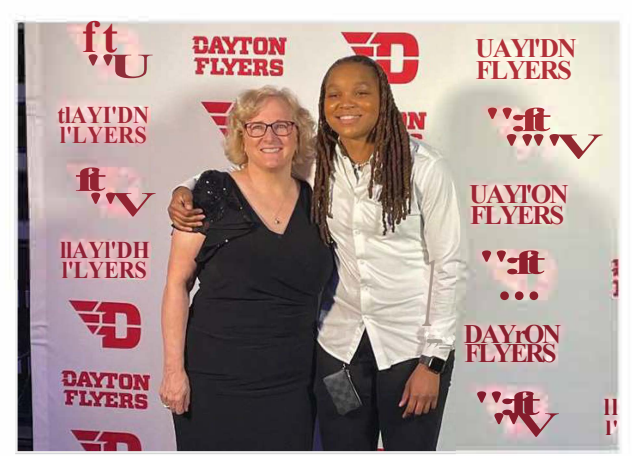
University of Dayton engineering studentathlete wins top honors at the R.U.D.Y.S.