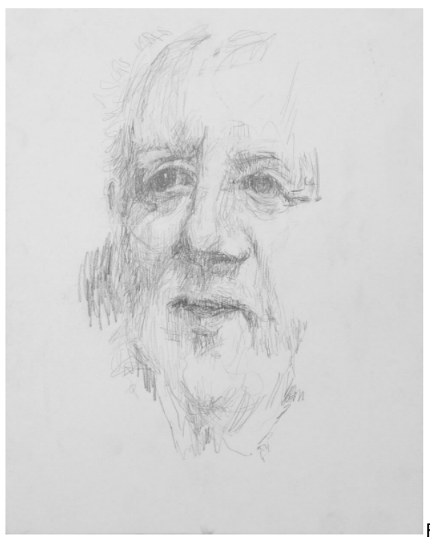
Fig. 2 Dawson, pencil on paper, 2019