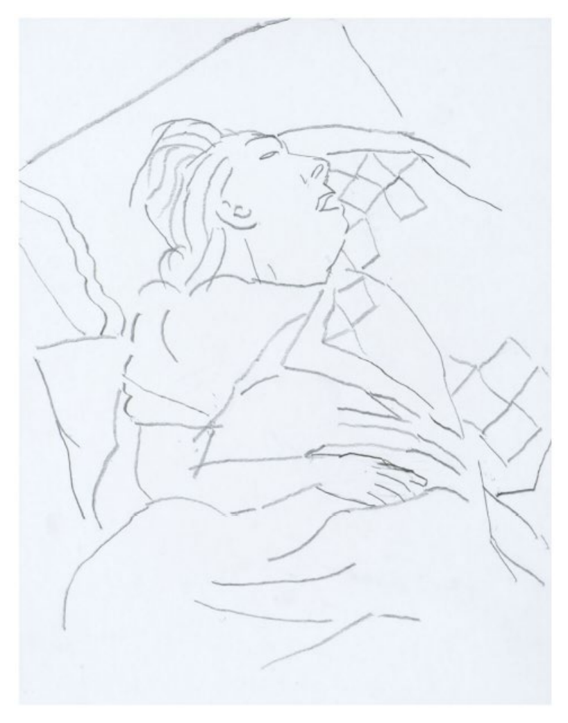
Fig. 3 Pat(I) Pencil on Paper 2016