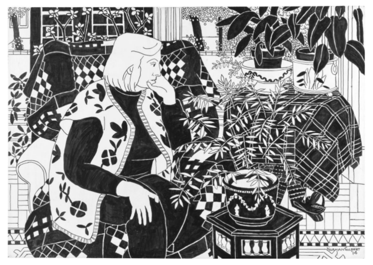
Fig. 2 Pat II, Indian Ink on Board 2014

Pat died at the age of eighty-six, on August 3, 2016, six days after suffering a devastating stroke. Norman's final drawings of Pat were carried out as he kept vigil by her bedside during her last days. The resultant series of twenty-five drawings, Hospital Drawings of Pat , depict Pat as she lay dying in the hospital. The series of drawings culminates with one final drawing created in the moments immediately after Pat's death. To complement his final drawings of Pat and chronicle their creation, Norman recorded an interview conducted by a close family friend on August 21, 2016, just weeks after Pat died. The interview, which was intended to add context to the drawings for curatorial purposes only, provides us with a rich and complex record of Norman's experience that can be analyzed qualitatively to explore an Alzheimer's caregiver's experience through the lens of an artist. This case study is aimed at examining Norman Gilbert's final drawings of Pat Gilbert along with an associated transcript from this interview to explore Norman's reflective processes related to his experience as a partner in care with his loving wife who lived with and ultimately died from an Alzheimer's related illness.