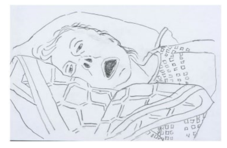
Fig. 4 Pat (II), Pencil on Paper 2016

Hospital Drawings of Pat are composed with the same economical, deliberate, linear mark making that characterizes so much of Norman's prior artistic output.