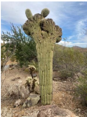
The rare Crested Saguaro. A 'young' cactus just beginning to grow side arms after 75 years. The crest may end up 6 ft wide.

There will be more about Arizona and meeting Tuck in the March Newsletter. But I will leave you with a couple of pictures of cacti and a picture of a snake! Not just any snake but a Western Diamondback Rattlesnake – and not one that I would like to meet!