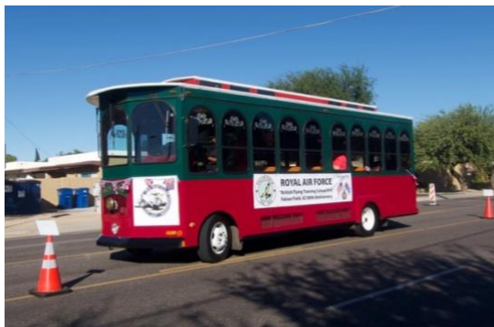
Vintage trolley, decorated, in line and ready to go!