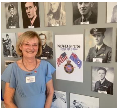
Me by the photo of my father (top of the two photos to the right of the logo)

On November 13, we went to the Gala Dinner and Hanger Rededication. Unlike, the hanger in Clewiston which blew down in Hurricane Wilma (2004), the two WW2 hangers at Mesa are still there, in good condition and are well used for their original purpose which was to house aircraft!