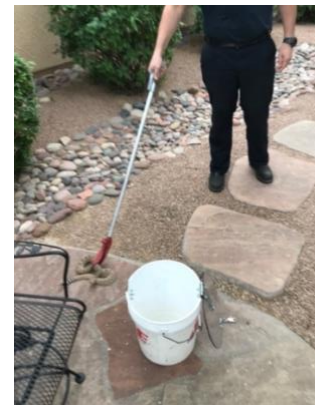
Fireman from the Oro Valley Fire Service removing one of two rattlesnakes from Tuck's yard at 14.45 local time – about two hours before we arrived there for dinner!