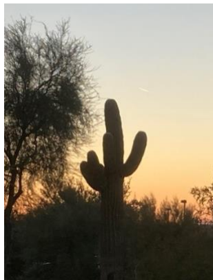
A Saguaro Cactus at sunset (17.24 local time). It takes 75 to 100 years for the cactus to grow its first arm!