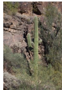
One of the many! By Saguaro Lake

On November 13, we went to the Gala Dinner and Hanger Rededication. Unlike, the hanger in Clewiston which blew down in Hurricane Wilma (2004), the two WW2 hangers at Mesa are still there, in good condition and are well used for their original purpose which was to house aircraft!