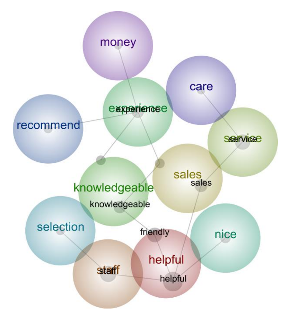
Figure 1: Conceptual map of consumer reviews