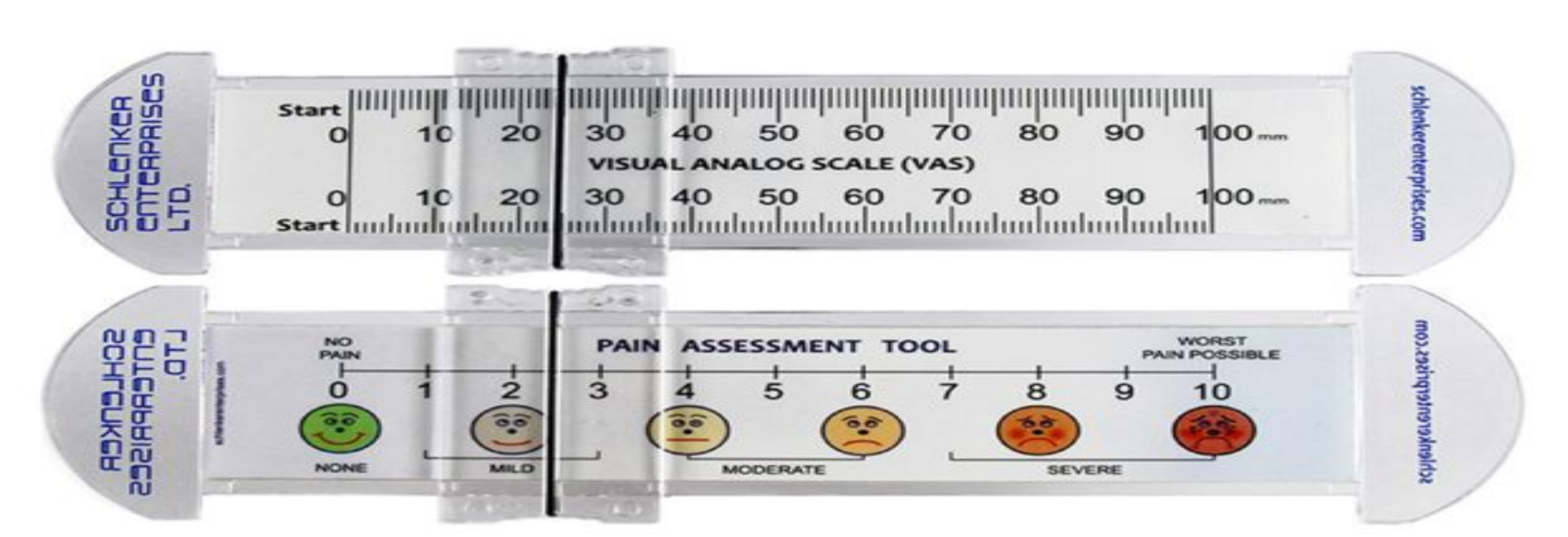
Figure 2. Visual Analog Pain Scale

Uludağ University found that In the group that received their injection with the Z-track method their average pain was reported to be 28.30 with an average leakage of 6.93 mm. The control group which did not receive Z-track injections had an average pain of 36.4 and average leakage of 10.03 mm.