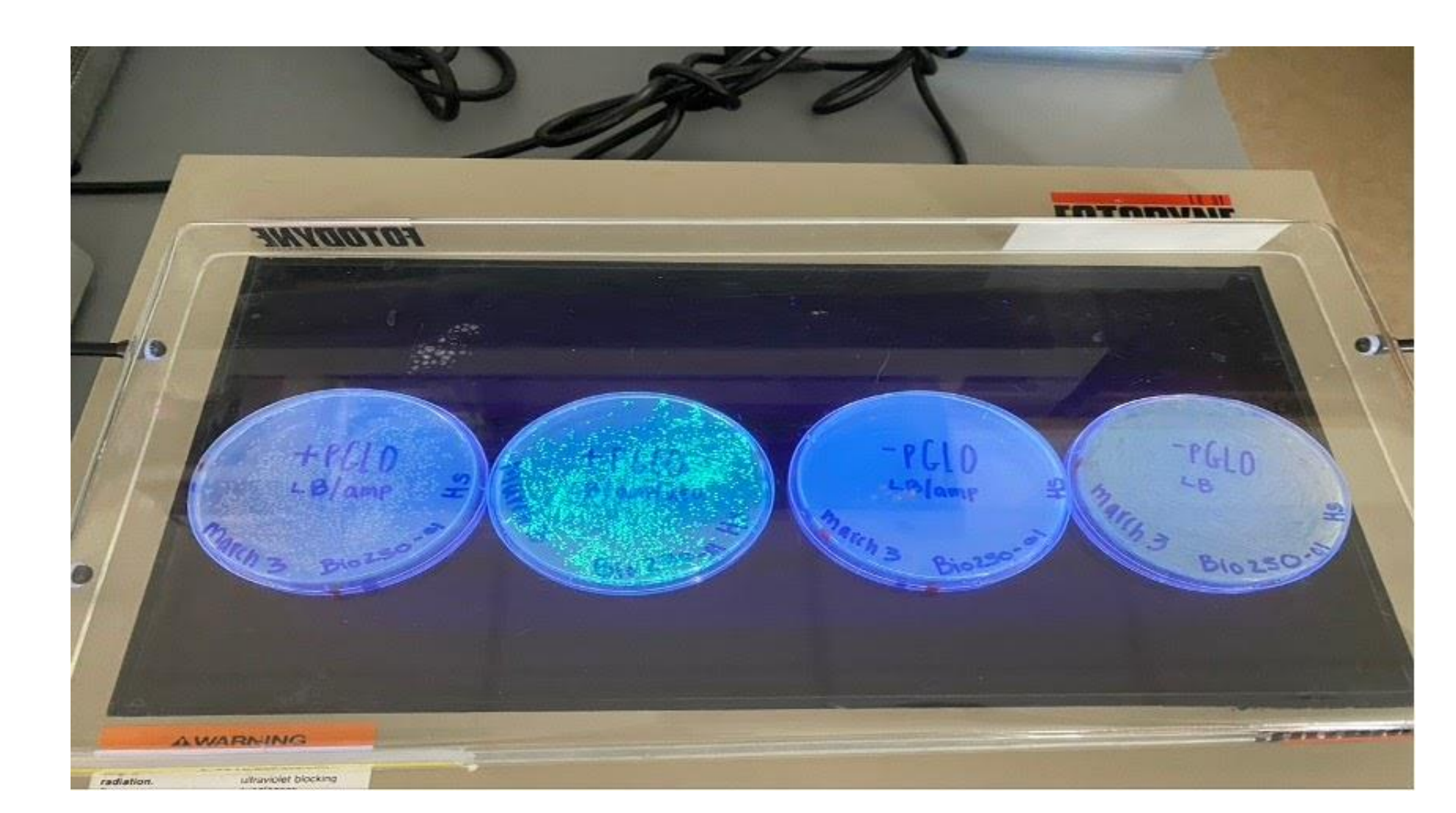
Figure 3. Bacteria growth and glow on +pGLO and -pGLO plates.