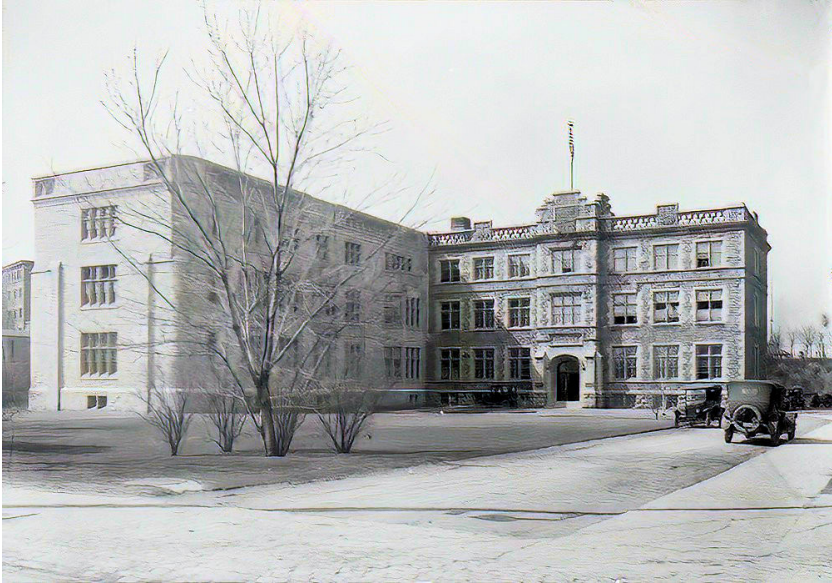
Public Archives of Canada Building, 1925, showing the new wing to house war trophies

these files. What were the files and what became of them? And to be clear, these million files were not the “CEF Service Documents” that Library and Archives Canada (LAC) now has online under the title “Personnel Records of the First World War.” 2