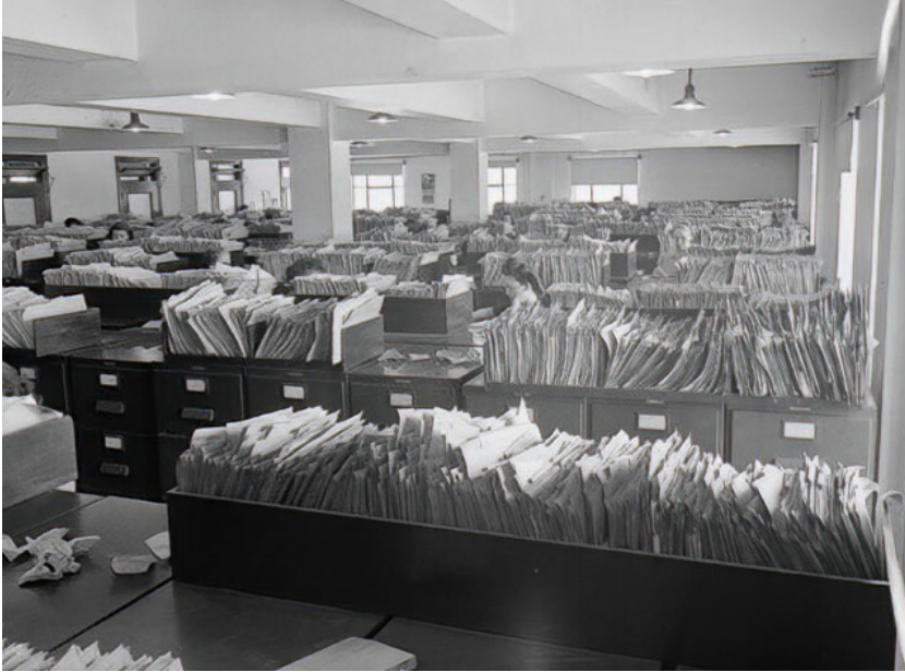
File Cabinets in the Records Storage Building on the Central Experimental Farm, Ottawa.

they remained in the control of DND. Most of the files were stored in the Daly, Jackson and Hunter Buildings in downtown Ottawa. 5