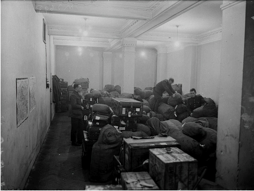
Property Room, Estates Branch, OMFC Headquarters, London 1915-1918. Soldiers are sorting the property of fallen soldiers for return to next of kin.

one in the Military District where they attested; one at the Overseas Military Forces of Canada (OMFC); another at 2nd Echelon at General Headquarters in France; and, of course, one at the Central Registry at Militia and Defence Headquarters. In Ottawa, they started to greatly expand the number of file block numbers, some of which covered very broad categories, such as “Infantry Officers” and “Casualties – European War.” Each of these blocks included tens of thousands of men.