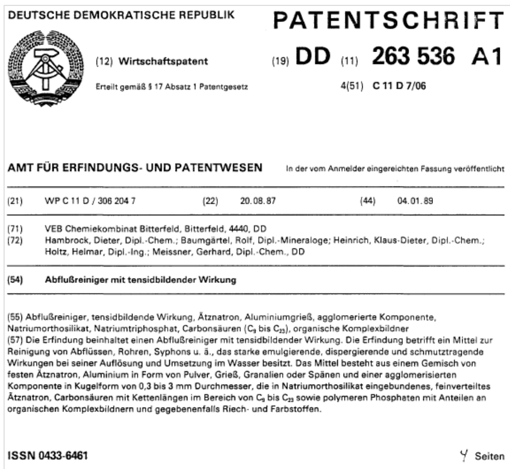
Figure 4: Example of a patent from the 1980s