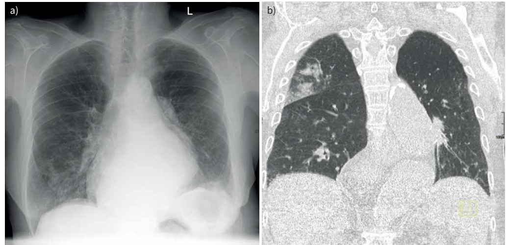
FIGURE 2 A 79-year-old female presented to our emergency room with symptoms of acute exacerbation of COPD. a) Conventional chest radiograph without evidence of radiological abnormalities; b) low-dose coronal plane computed tomography of the same patient with alveolar consolidation of the right upper lobe.