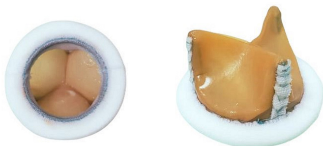
Figure 1 Bioprosthesis INC, manufactured at the ‘Ignacio Chávez’ National Cardiology Institute.

axis (OPG), the receptor activator of nuclear factor \kappa B (RANK) and its ligand (RANKL). 7 These processes perpetuate valvular calcification, progressive reduction of the aortic valve area (AVA).