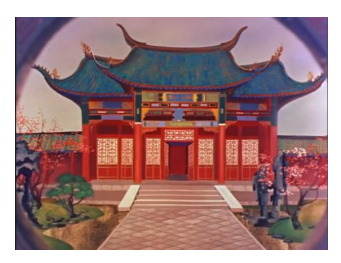
Fig 4: Screenshot of The White Snake Enchantress (1958)

Due to a lack of research, The White Snake Enchantress movie chose background, architecture, and costume references from a variety of periods. In the film, Madam White's house is decorated with colorful decorations of glazed tiles and painting beneath the roof (see figure 4), which would only have been found in the houses of imperial families (see figure 5).