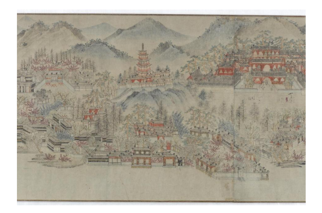
Fig 9: Part of Scenic Attractions of West Lake, ca. fourteenth-century depiction of the scene in the mid-thirteenth century. Ink and color on paper, 33.3 × 1849.8 cm. Freer Gallery of Art, Smithsonian Institution, Washington, DC: Gift of Charles Lang Freer, F1911.209.

painting can catch a glimpse of the Hangzhou landscape. Although, technically, this scroll was not well painted, it does provide a first-hand record of landmarks.