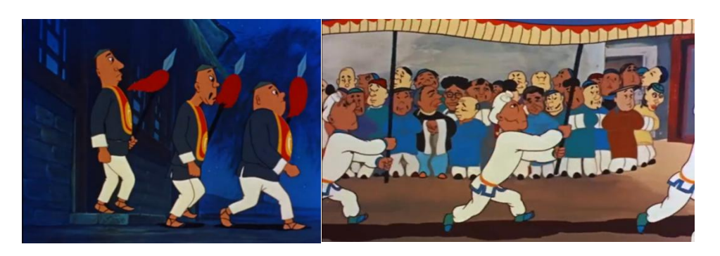
Fig 7-8 screen-shot of The White Snake Enchantress (1958)

were popular during the Ming dynasty—200 years later than the original story. In figure 7, the cone-shaped hat that adorns police was a feature characteristic of the official uniform during the Qing dynasty. This mixing of periods constitutes a definite failure in the animation's concept-art design. Researching and depicting the cultural background of the original story would, instead, have afforded audiences the opportunity to engage with the unique features of this Asian story, providing them with a different experience from watching a Disney film.