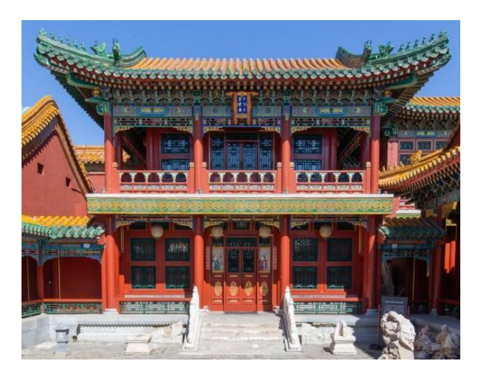
Fig 5: Photo of Jiyun Floor in the Imperial Gardens, built in the Ming dynasty

Artist depiction of the environment in the animated version did not match the original story either. The original story took place in Hangzhou, which is a city surrounded by mountains in southeast China. The weather in Hangzhou is humid and warm, which makes this city green in all seasons. Yet, in the film, there is a lack of trees and mountains in the background. Instead, its landscape and architectural style is indicative of Northern China. (see, figure 6)