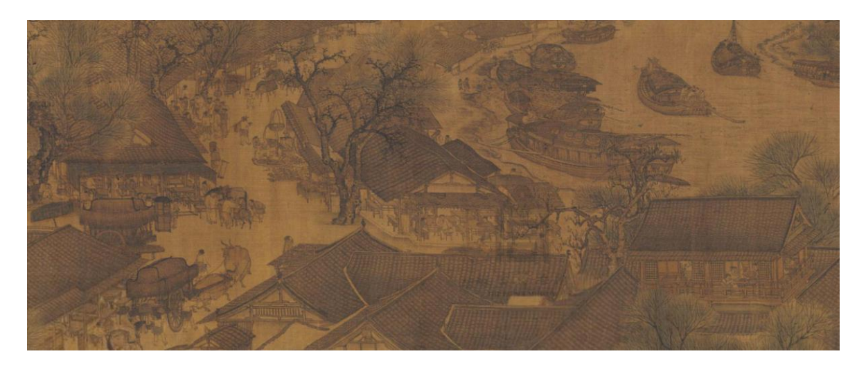
Fig 3 Zhang Zeduan, Along the River During the Qingming Festival. The Palace Museum.

groups of people and crowded buildings indicate a prosperous society, not the quiet, desolate town portrayed in the movie.