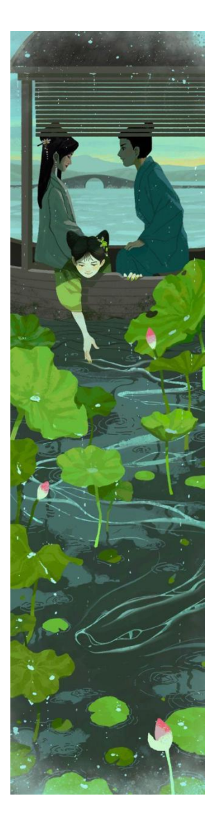
Fig 11: Illustration of the Legend of the White Snake