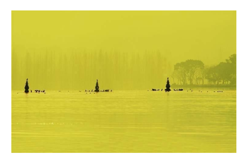
Figure 2: Photograph of Three Stupas

The cultures and scenery of the West Lake were portrayed, in detail, in the West Lake's Three Stupas . The stupas were originally built around the Northern Song Dynasty (1086-1094) by Governor Su Shi as a mark to prevent the accumulation of sediment in the lake which later became one of the ten views of the West Lake and inspired writers to create related legends (Figure 2).