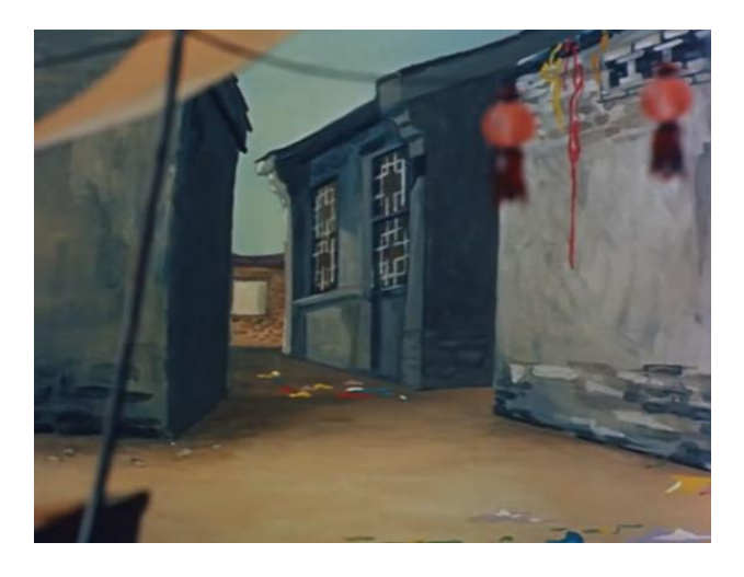
Fig 6: Screenshot of The White Snake Enchantress (1958)

Artist depiction of the environment in the animated version did not match the original story either. The original story took place in Hangzhou, which is a city surrounded by mountains in southeast China. The weather in Hangzhou is humid and warm, which makes this city green in all seasons. Yet, in the film, there is a lack of trees and mountains in the background. Instead, its landscape and architectural style is indicative of Northern China. (see, figure 6)