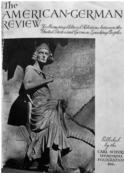
Fig. 1: Cover of the first issue of The American-German Review (September 1934).

This was, of course, an ominous predicament, and the foundation, in its first years reluctant to take a public position vis-à-vis the Nazi state, had to fight numerous accusations and denunciations in order to avoid being tainted as a propagator of Nazi thinking when it made special efforts in lifting German culture beyond the routine clichés about the Krauts. Referring to German culture as a source of inspiration, as it was done in the American-German Review , 8 came with the understanding that the way it was presented