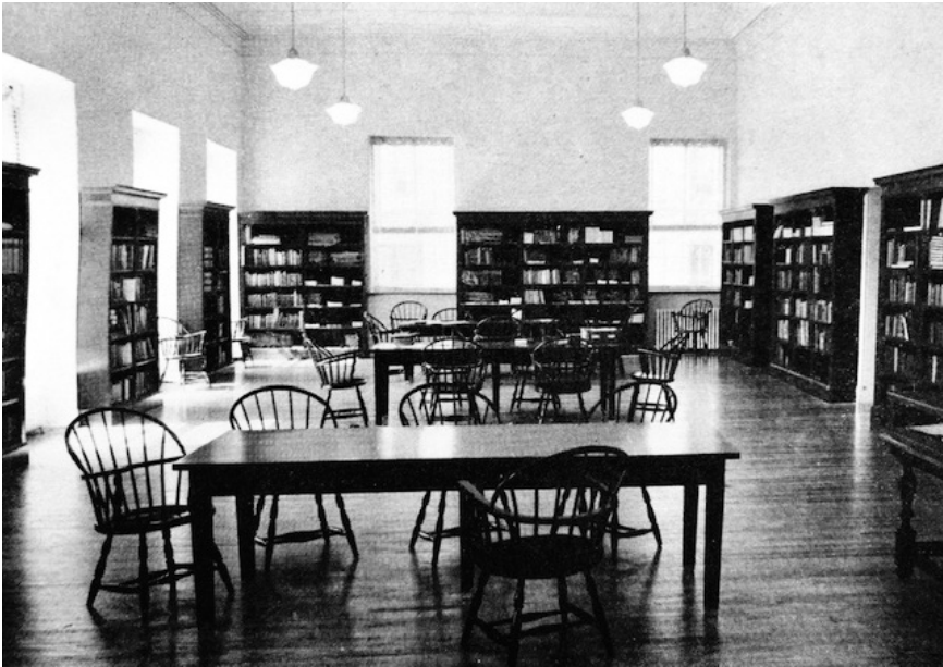
Fig. 5: Reference library in the Carl Schurz Memorial Foundation.