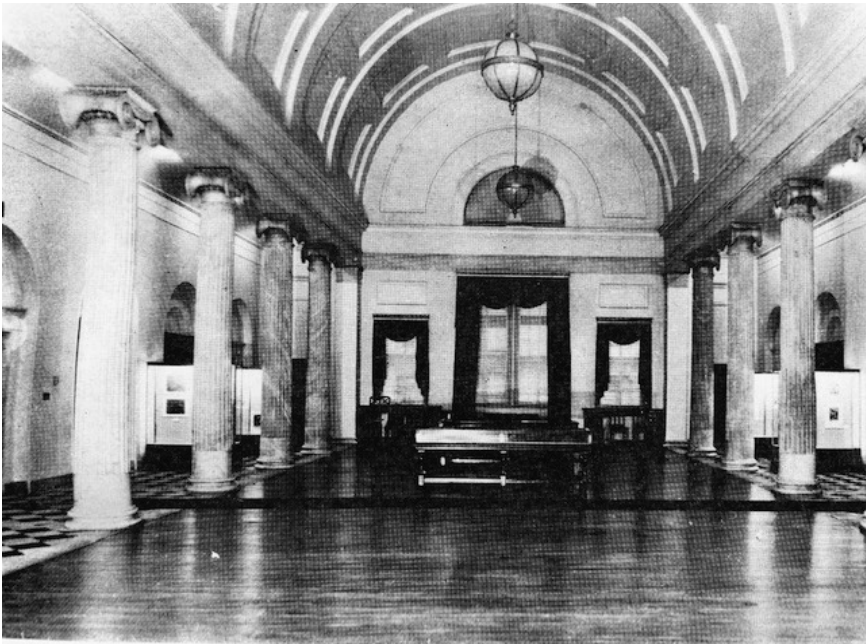
Fig. 4: Great hall in the Old Customs House.

As Charles Hexamer at the turn of the century added a scholarly component—the German American Historical Society—to the founding of a central organization of German Americans, the National German-American Alliance, so did Victor Ridder thirty years later in the program of the Erster