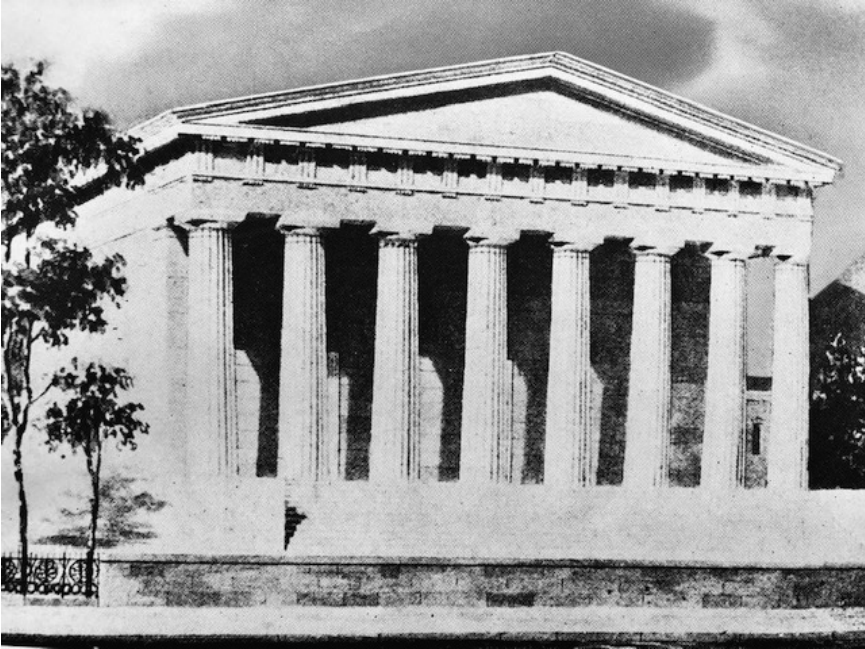
Fig. 2: Old Customs House in Philadelphia leased by the Carl Schurz Memorial Foundation at the end of 1939.

publications of the foundation. (fig. 3) Physically the building was not ideal for this purpose but offered space for offices, the research center with library and bibliographical collection as well as large hall that was used for concerts, exhibitions, and meetings where other groups would also convene.