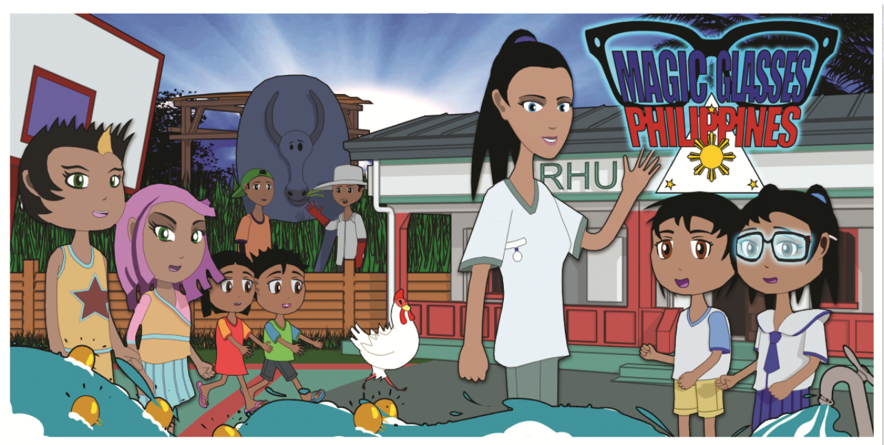
Figure 2. Cover of the cartoon "The Magic Glasses Philippines".